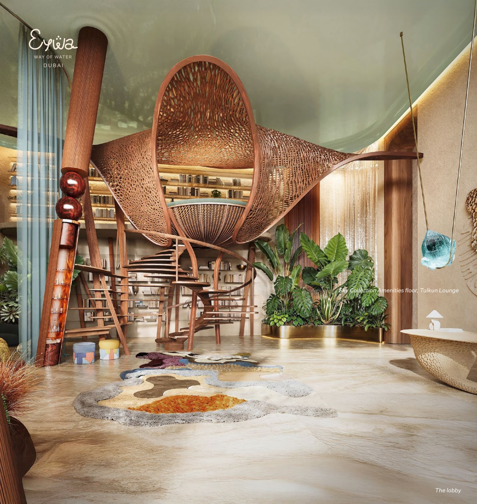
Sky Collection Amenities floor, Tulkun Lounge