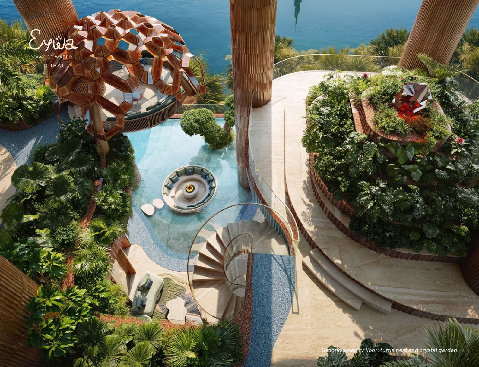
Second amenity floor: turtle nest and crystal garden