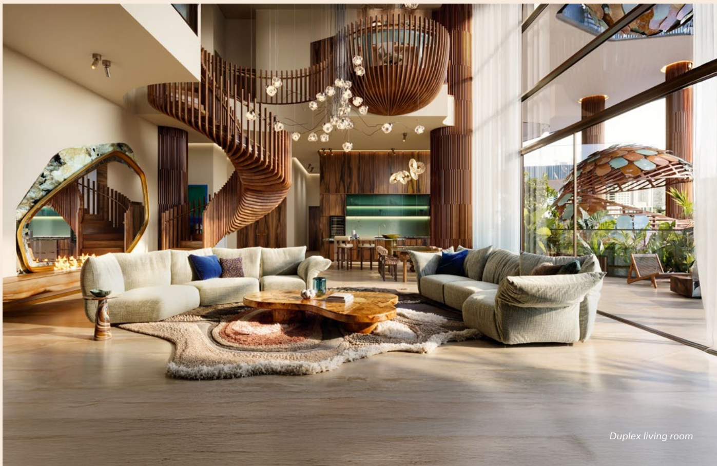
Duplex living room