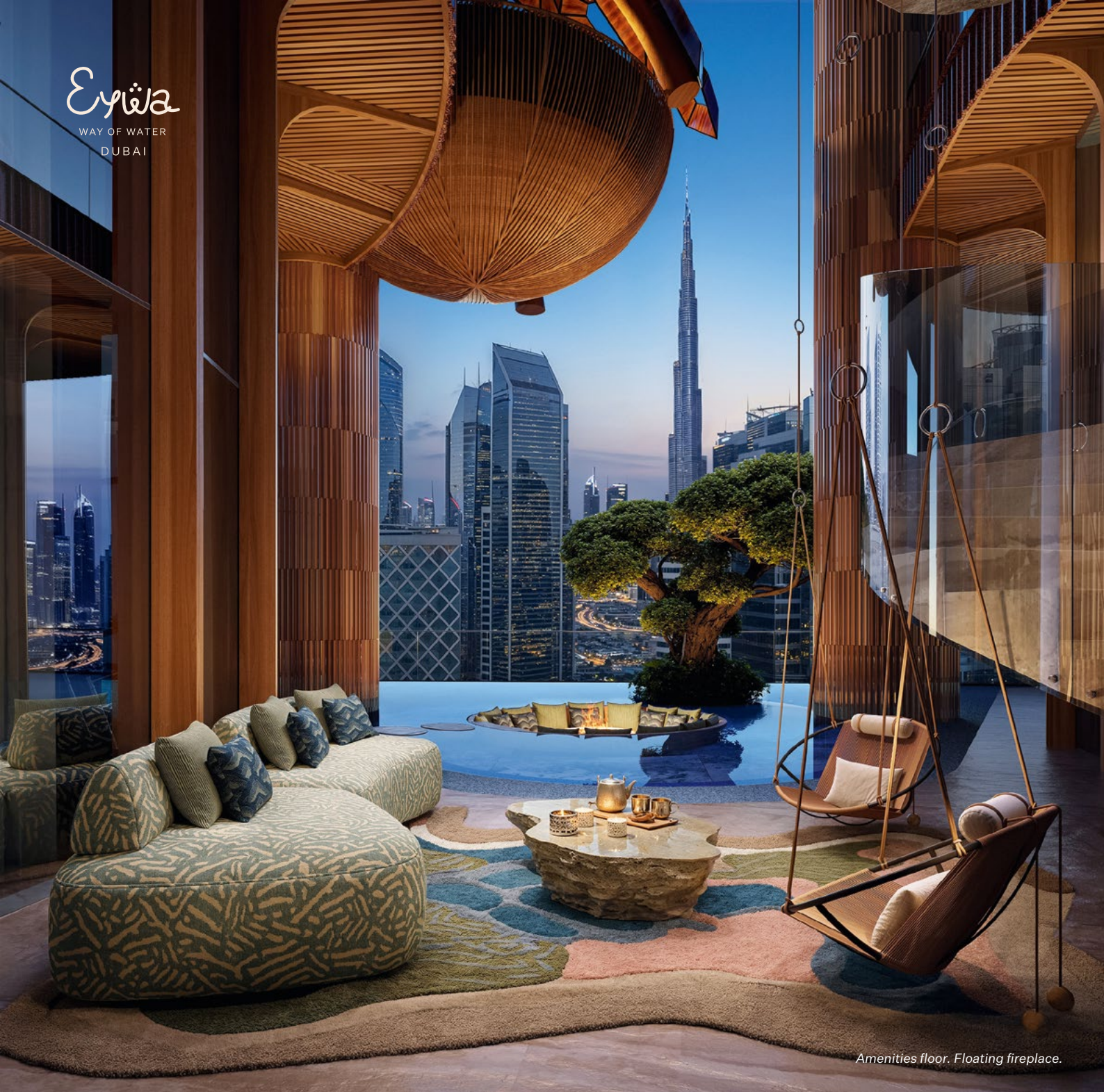
Amenities floor. Floating fireplace.