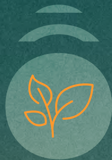
VERDANT OASIS AND OLIVE ORCHARD