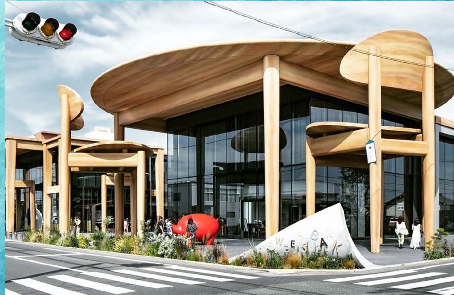
Sweets Bank, Hamamatsu City

The firm is credited to having helmed illustrious projects globally, such as Tokyo Tower, One & Only One Za'abeel, Tokyo Dome, Ritz Carlton Kyoto, Cairo Opera House, and now Sora Beach Residences Al Marjan Island, UAE.