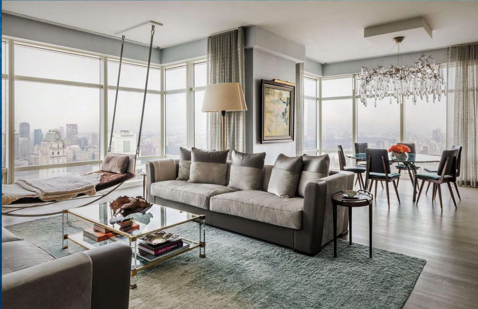
Lexington Avenue, New York.