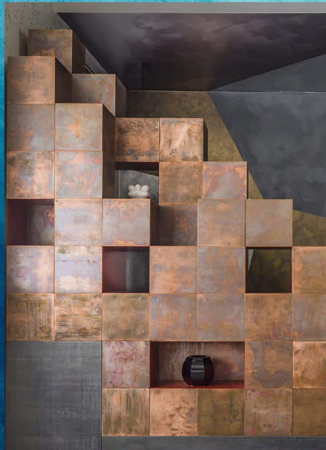
Lexington Avenue, New York.