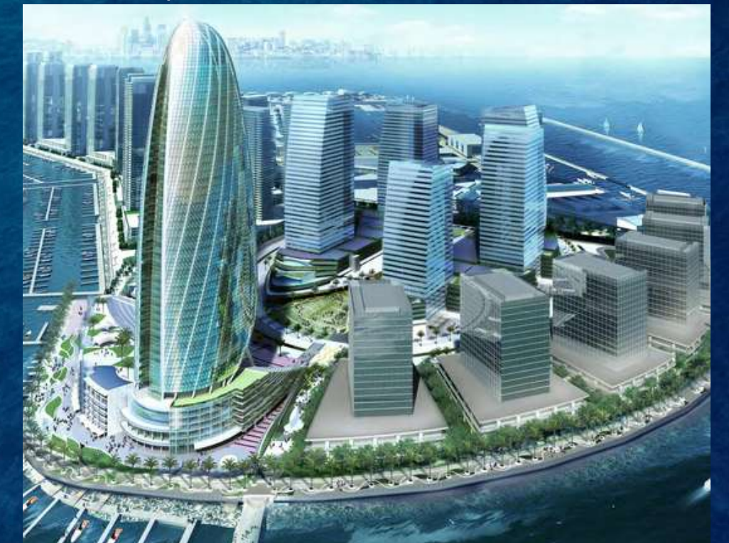
Dubai Marittimes City Landmark Tower