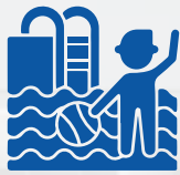
KIDS SWIMMING POOL