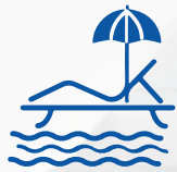
LEISURE POOL DECK