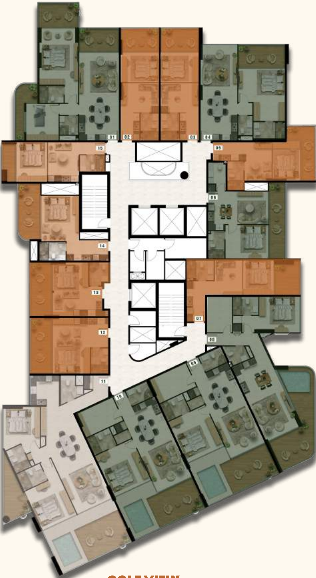
COMMUNITY & MARINA SKYLINE VIEW