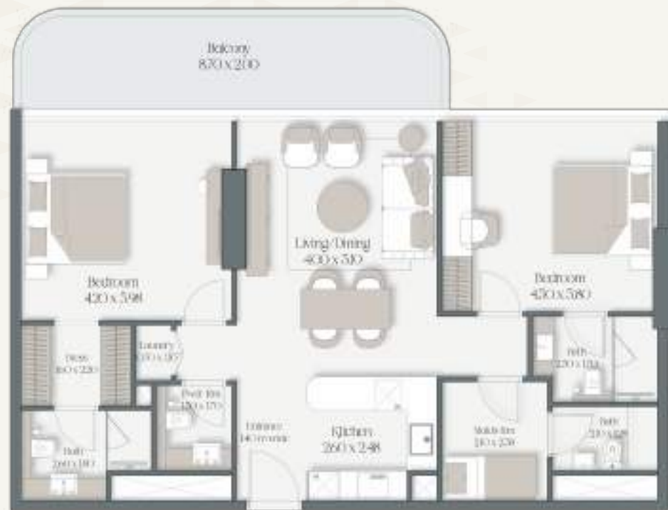
TWO BEDROOM TYPE 1