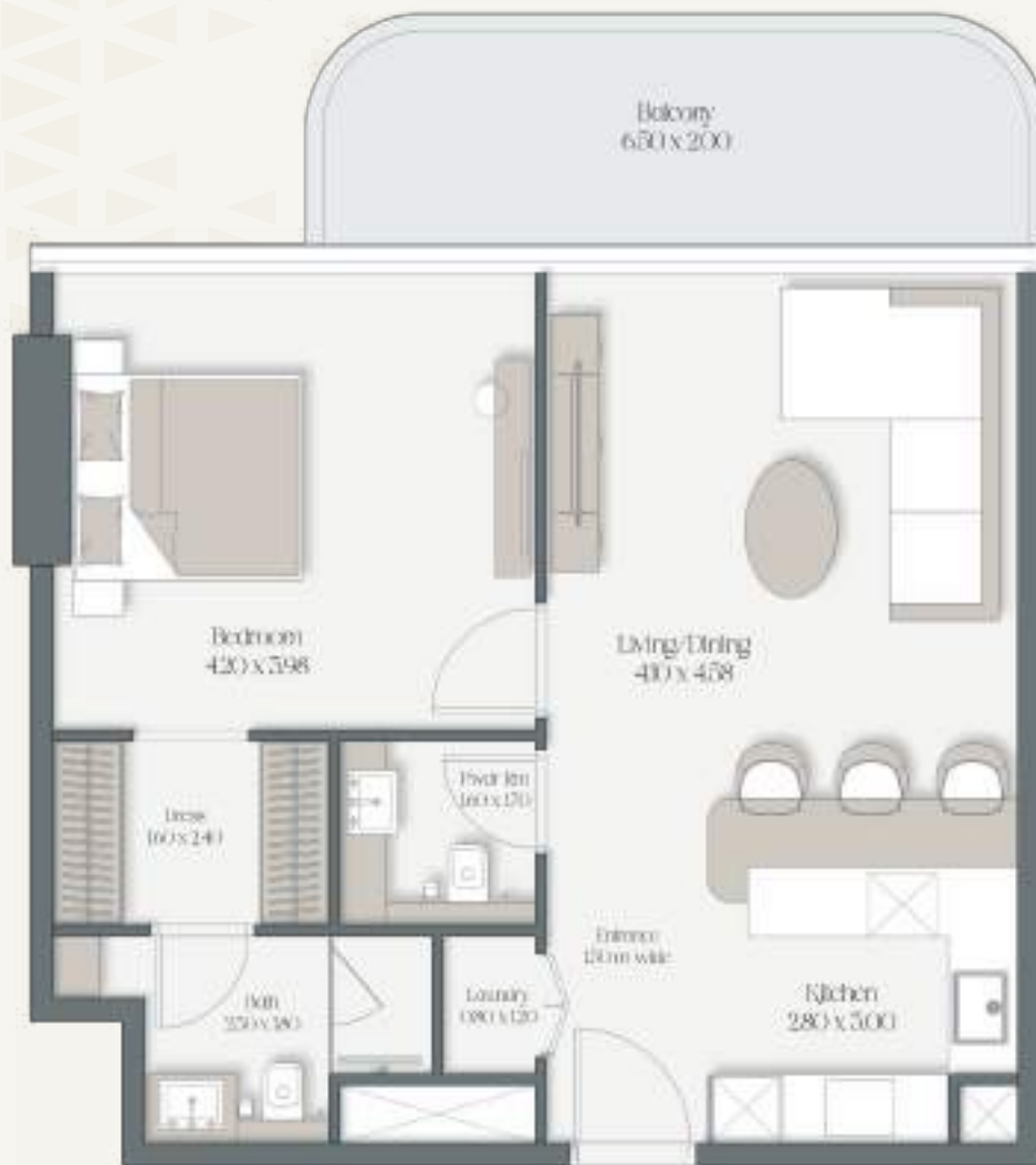
ONE BEDROOM TYPE 3