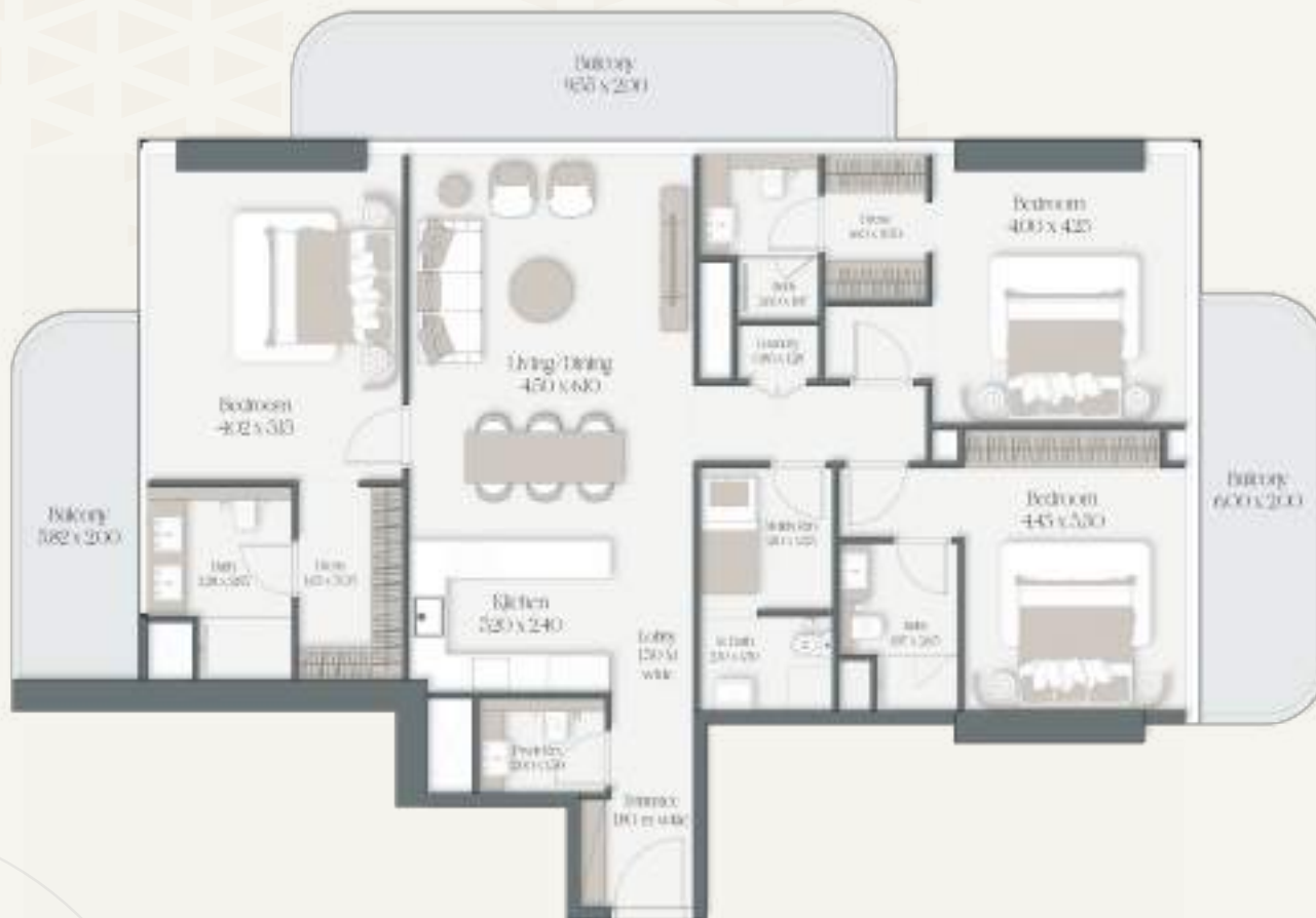
THREE BEDROOM TYPE 2