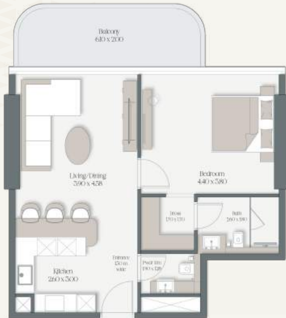
ONE BEDROOM TYPE 2