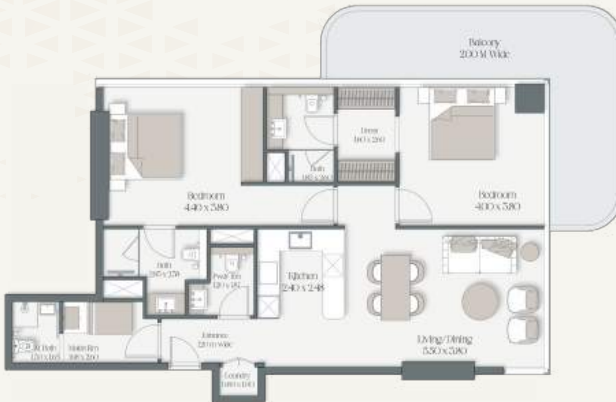
TWO BEDROOM TYPE 2