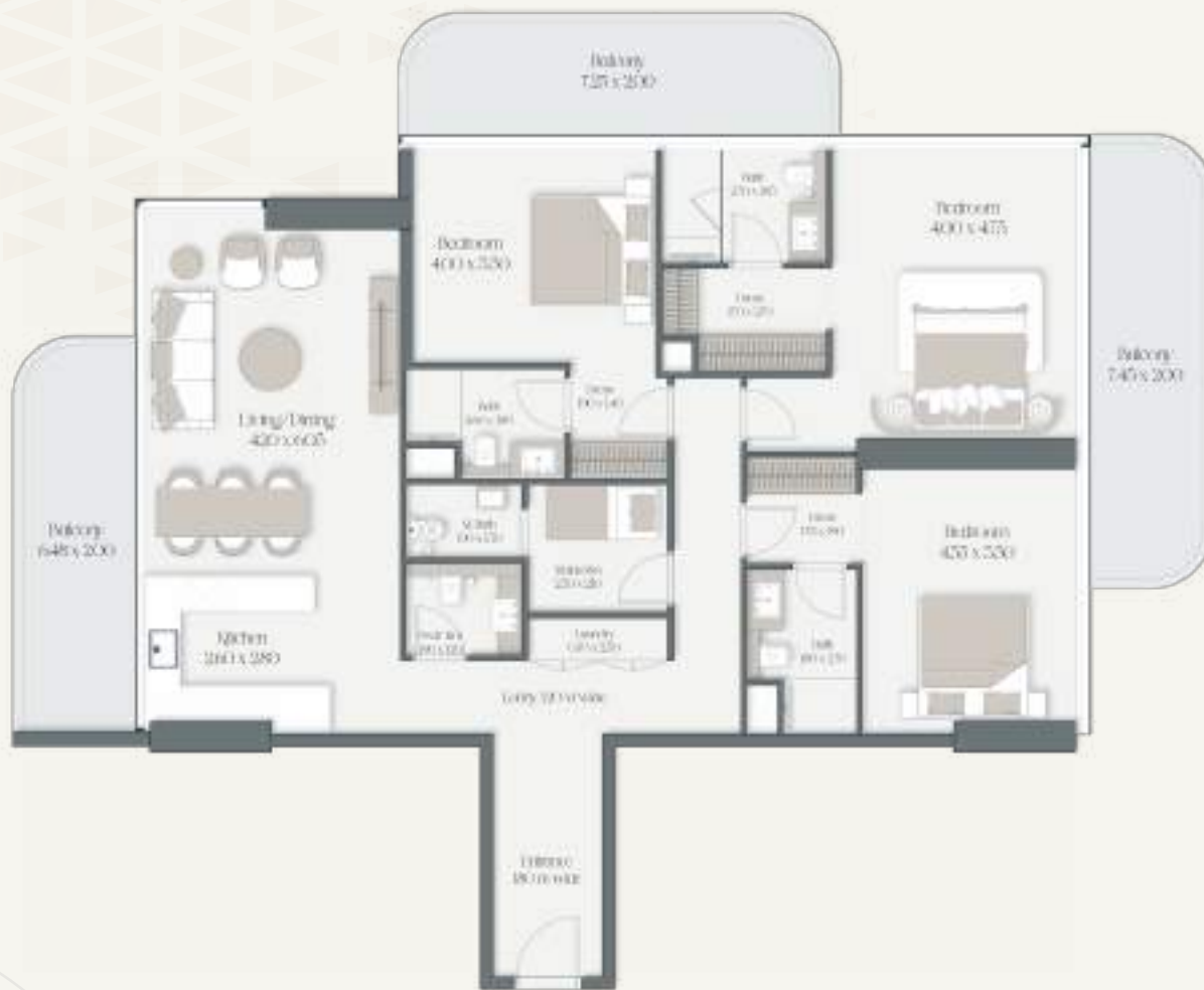
THREE BEDROOM TYPE 1