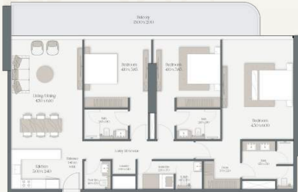
THREE BEDROOM TYPE 3