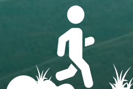
Rooftop Jogging Track