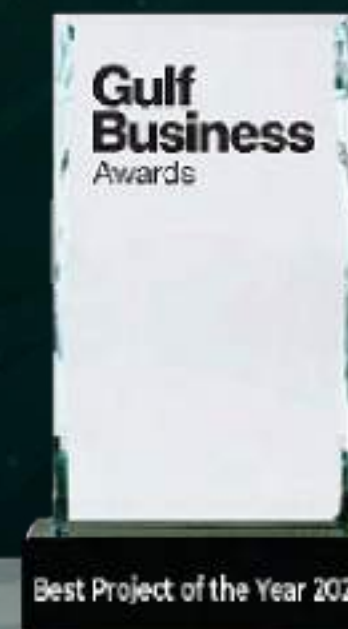
Best Project of the Year 2022