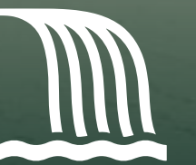
Water Fall Feature