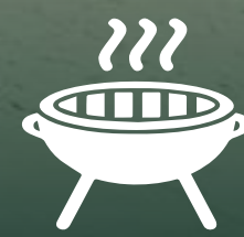
Rooftop Barbeque Area