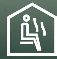
Sauna & Steam Room