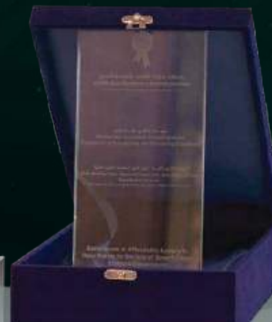
Best Project of the Year 2022