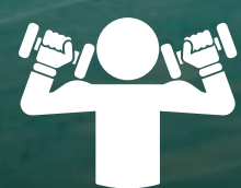
Full Health Club Indoor & Outdoor Gym