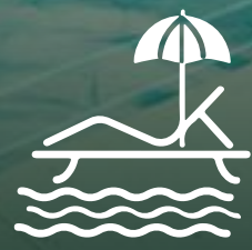
A Luxurious & Large Leisure Pool Deck