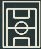
Indoor Football Court