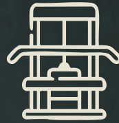
Skyview Fitness Centre