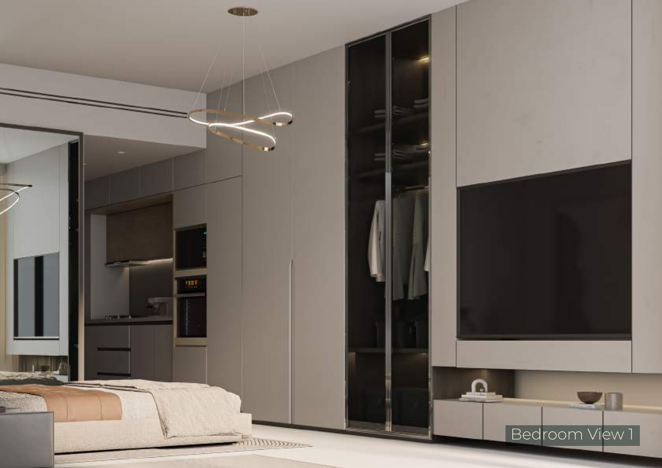
Bedroom View 1