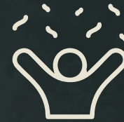
Skyview Restoration Area