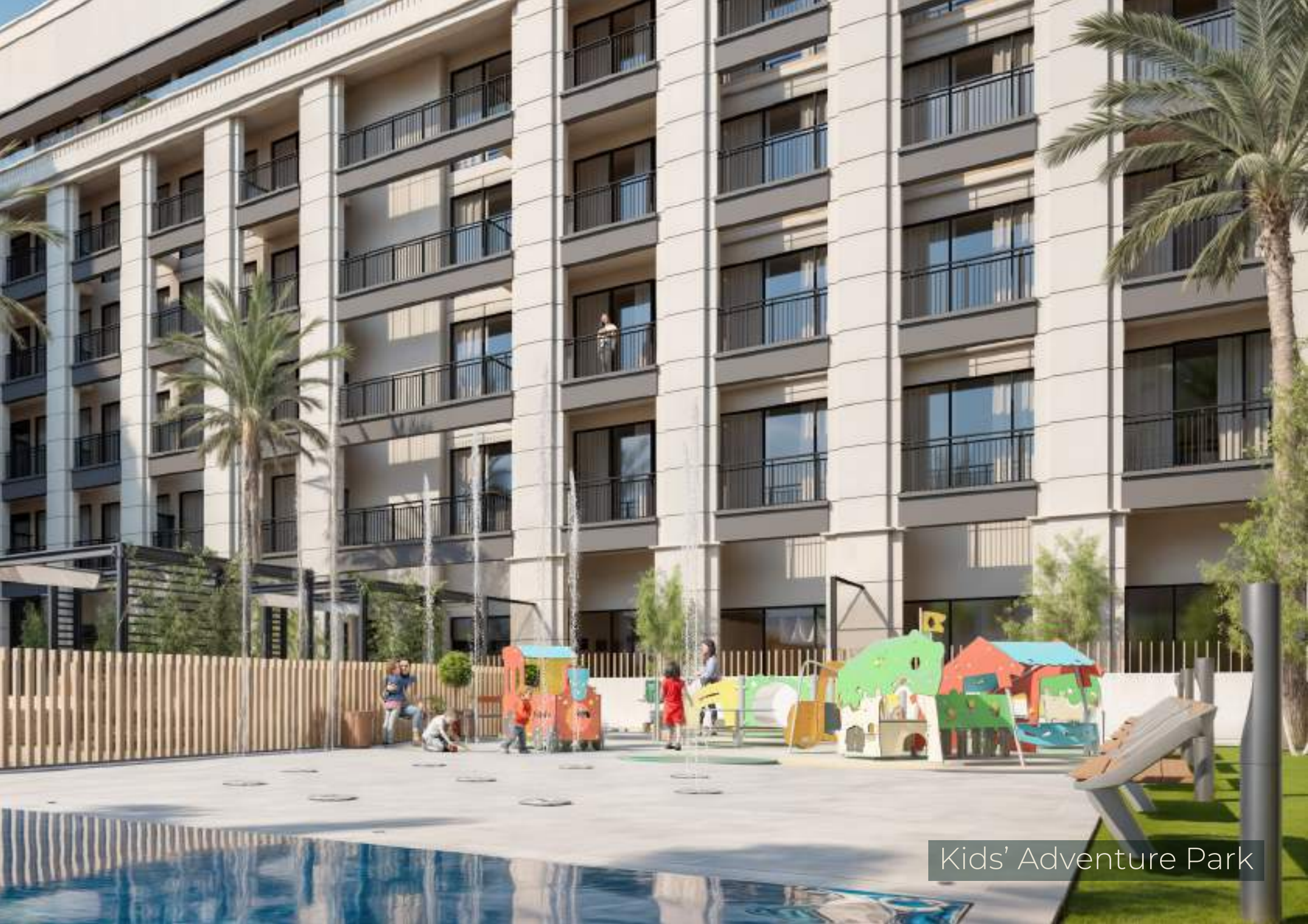
Kids' Adventure Park