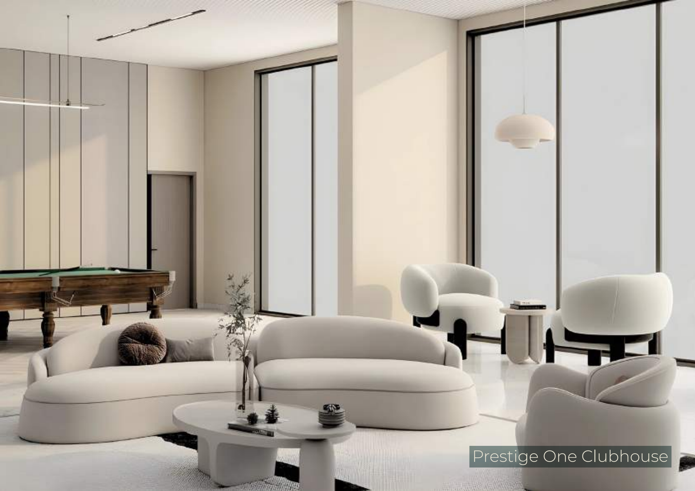
Prestige One Clubhouse