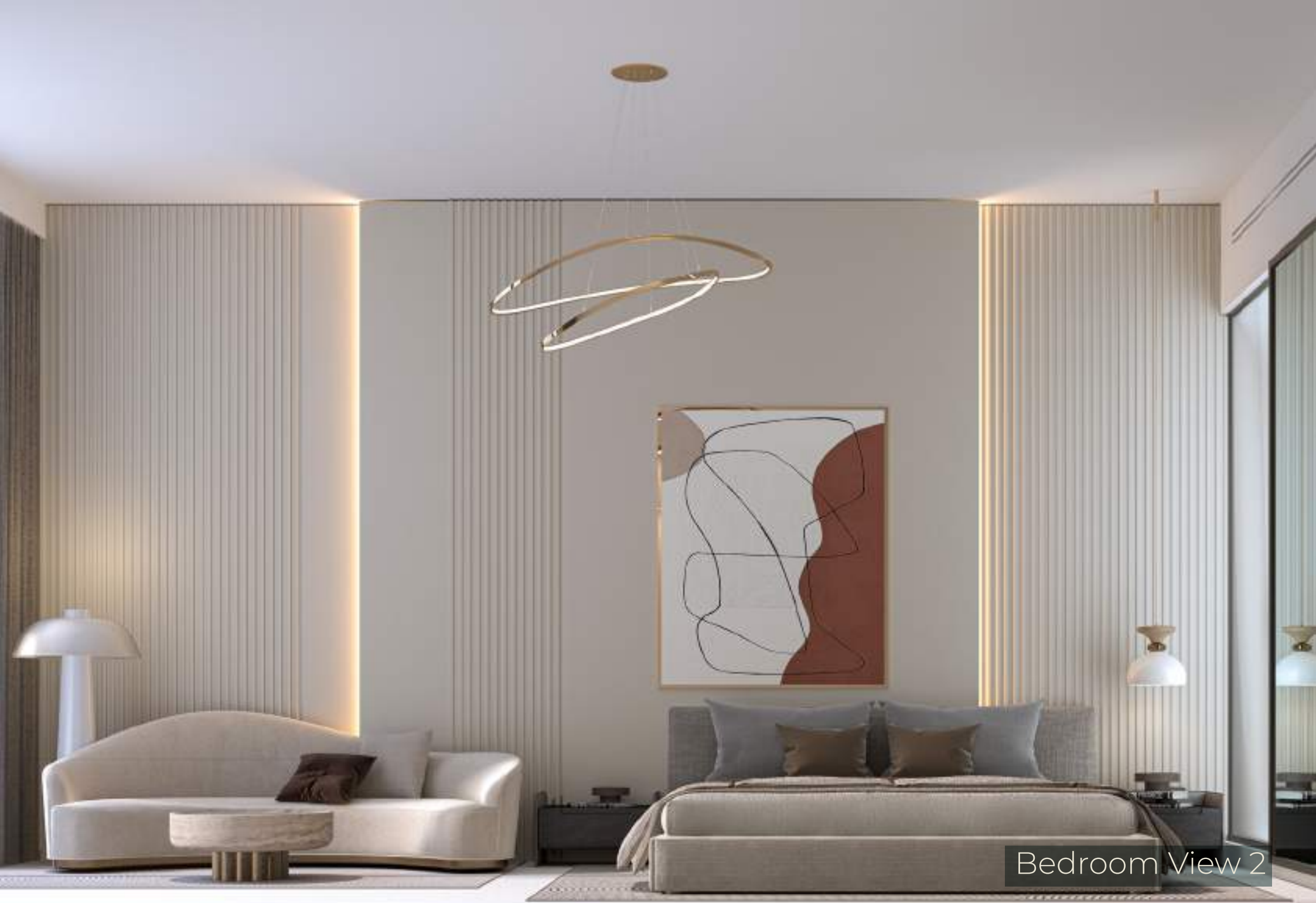
Bedroom View 2