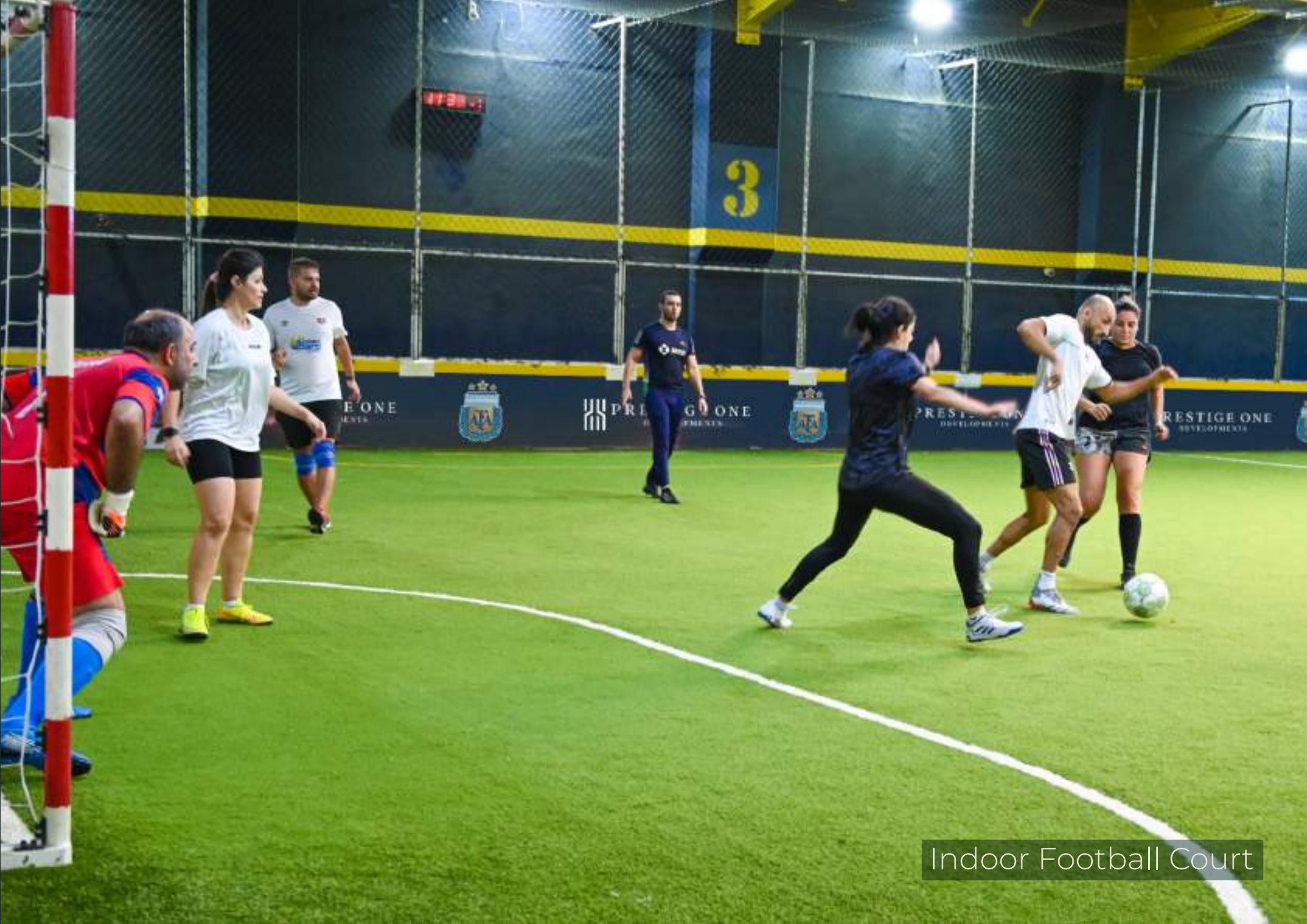
Indoor Football Court