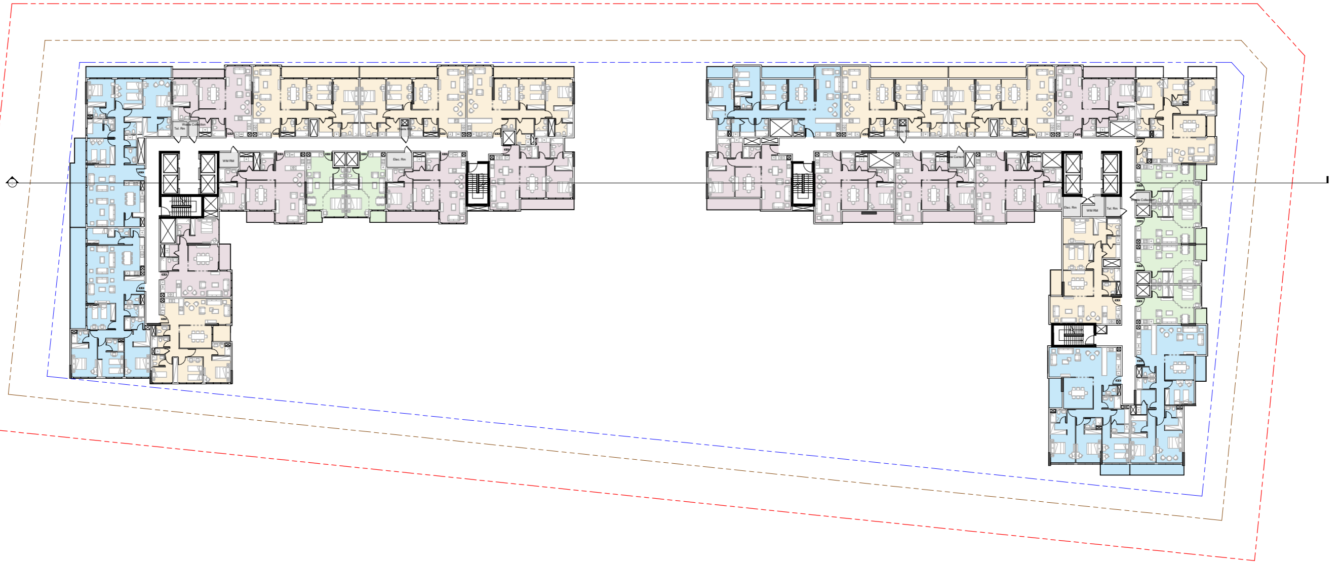
TYPICAL 2 ( 12TH TO 15TH )