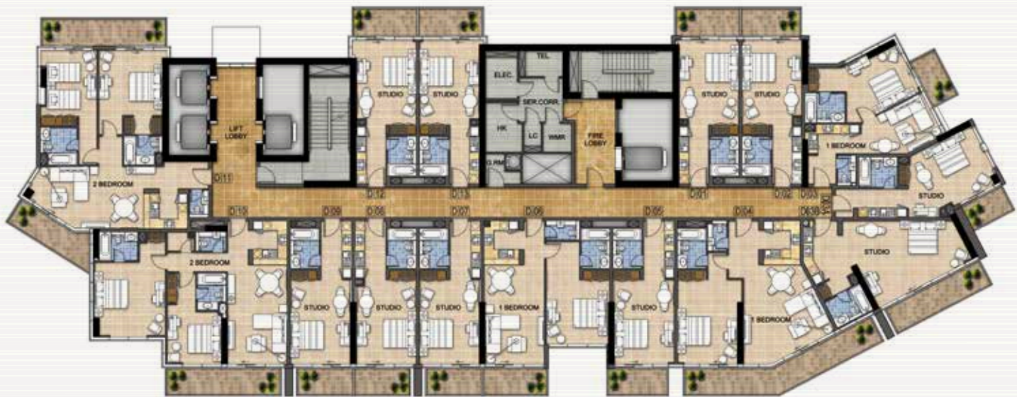
LEVELS 4-6 9-12