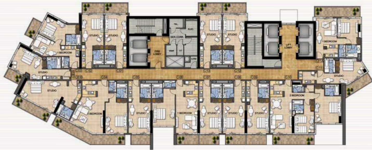
LEVELS 4-7 9-10 12-13 & 15