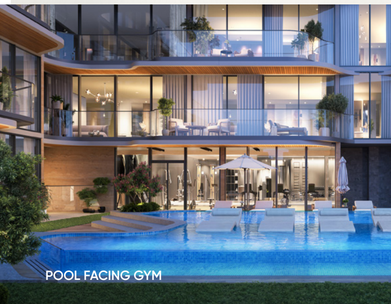
POOL FACING GYM