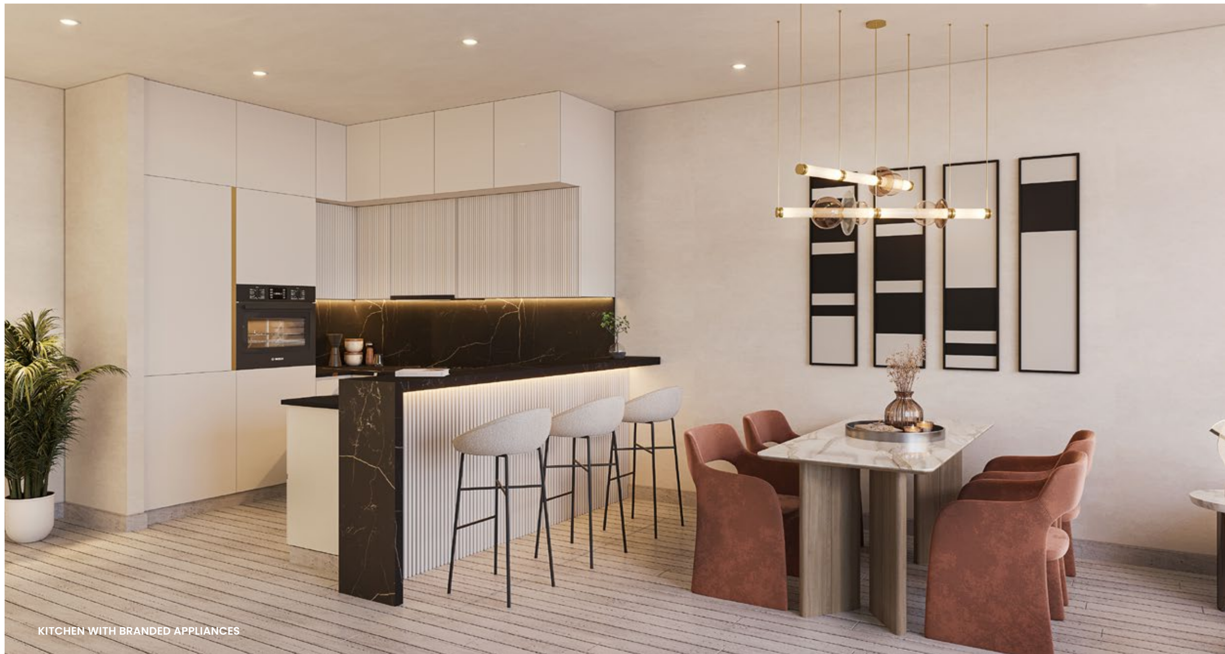
KITCHEN WITH BRANDED APPLIANCES