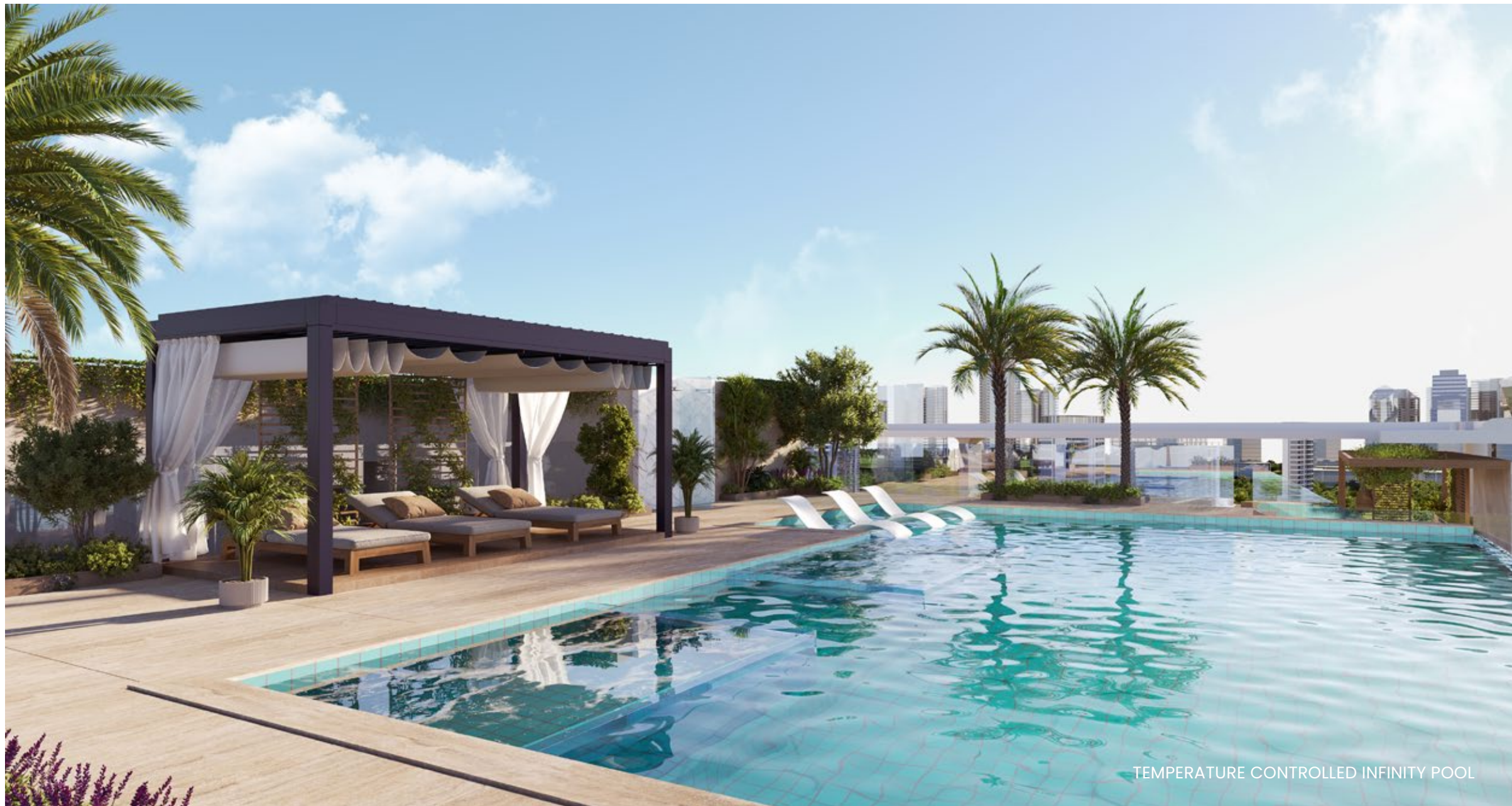
TEMPERATURE CONTROLLED INFINITY POOL