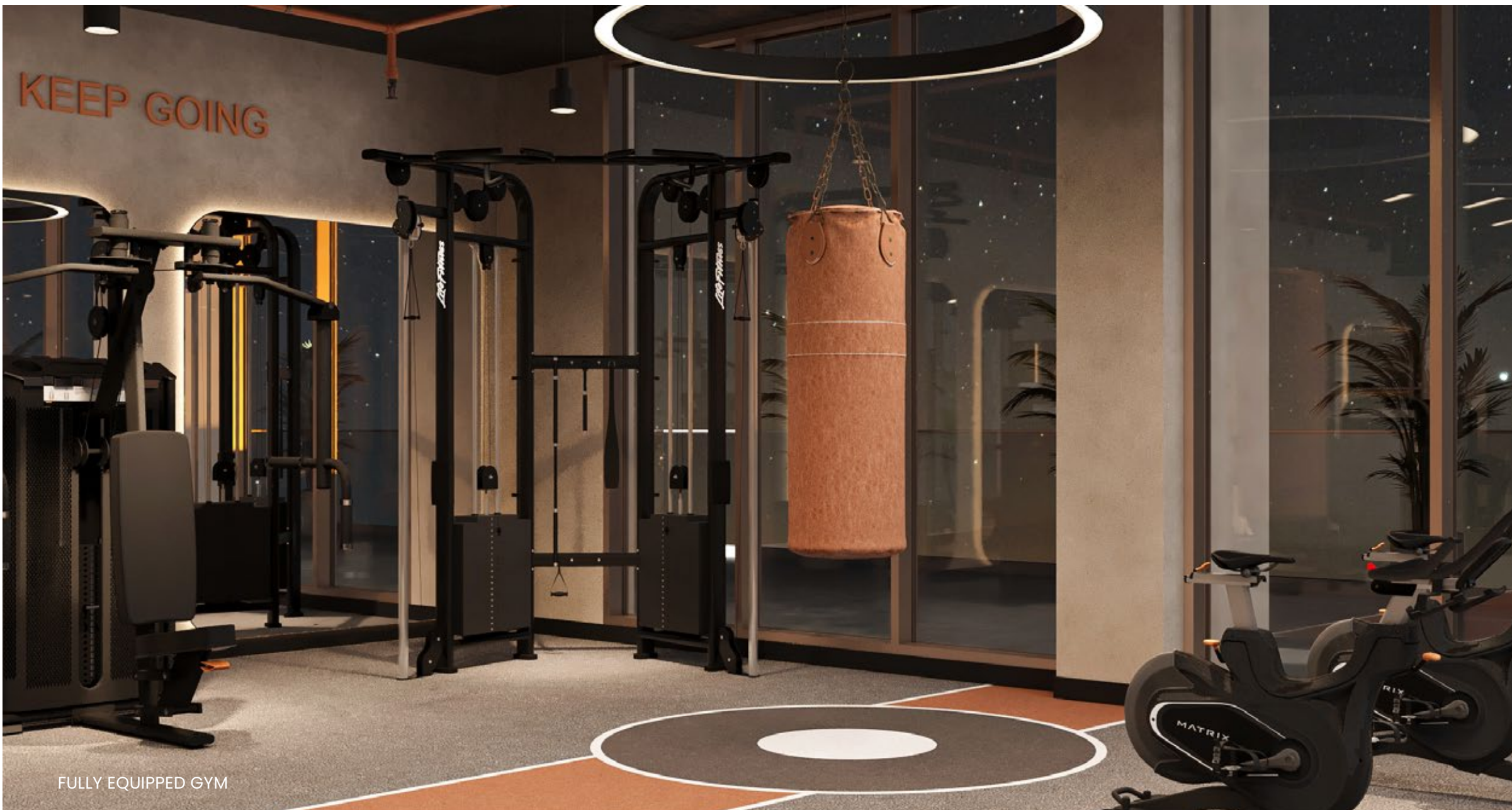
FULLY EQUIPPED GYM