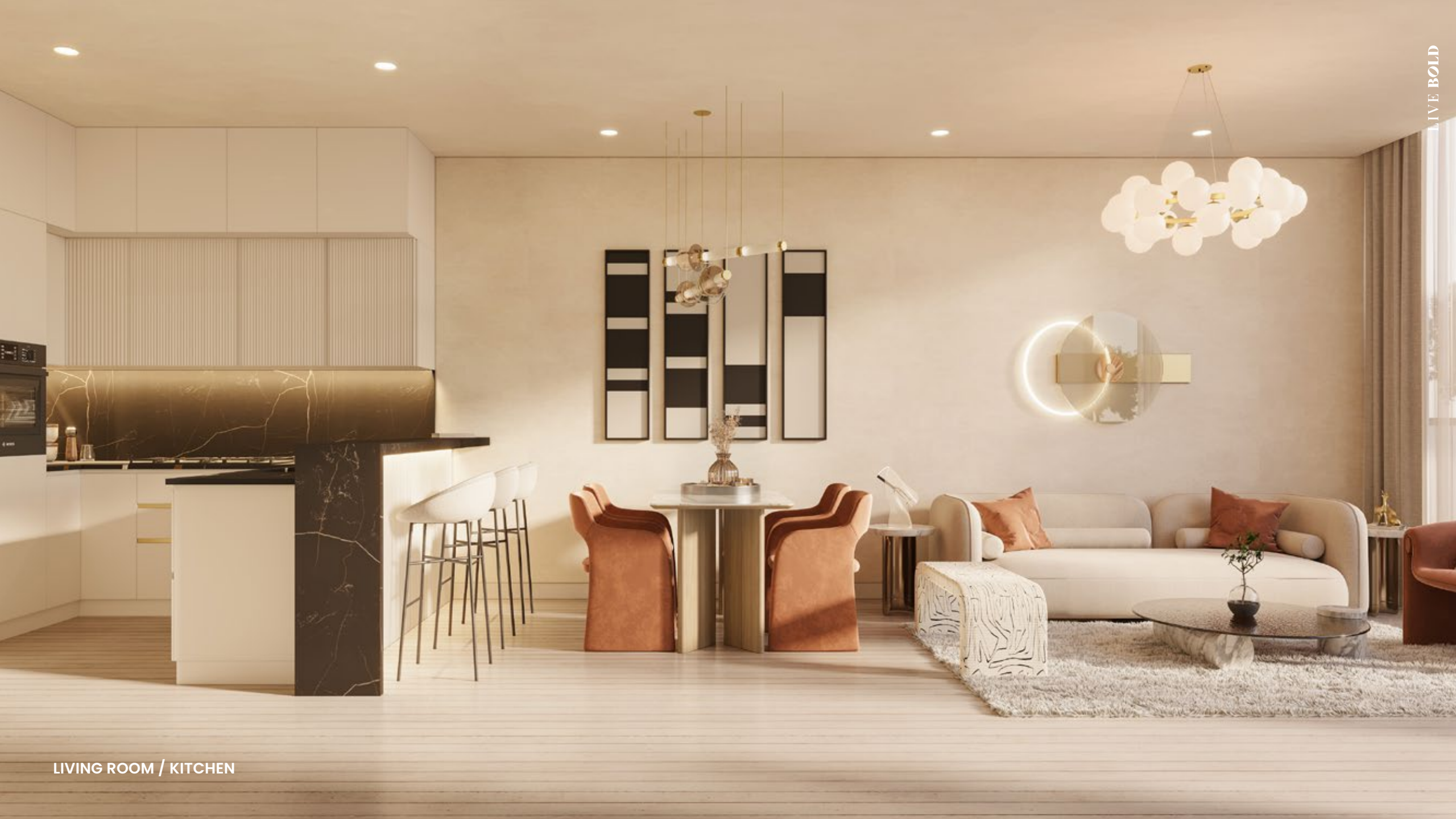
LIVING ROOM / KITCHEN