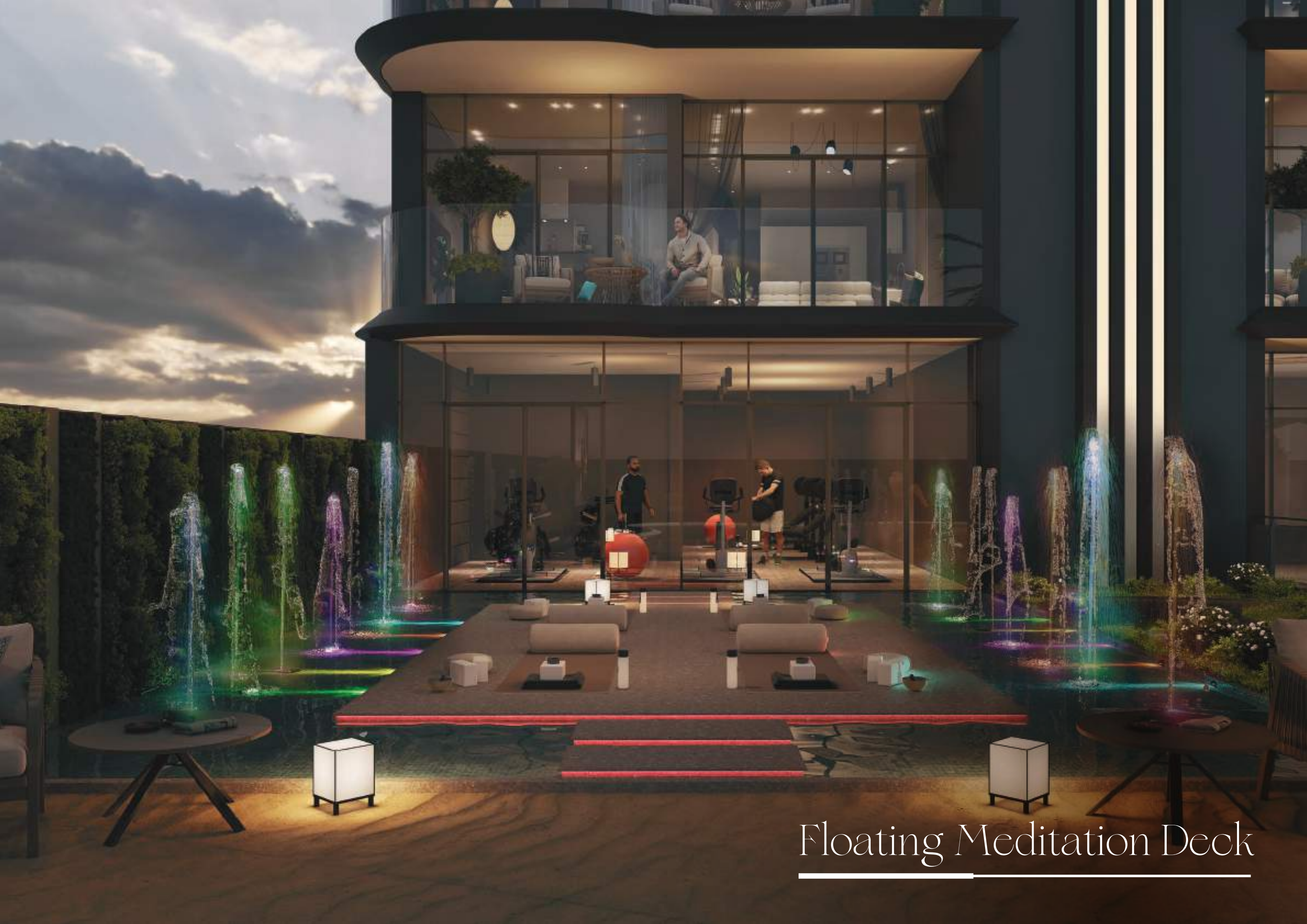
Floating Meditation Deck