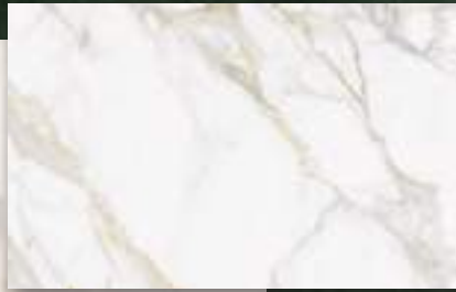
Porcelain bathroom walls & floors