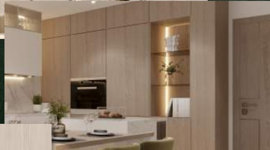
Oak veneer wall panels