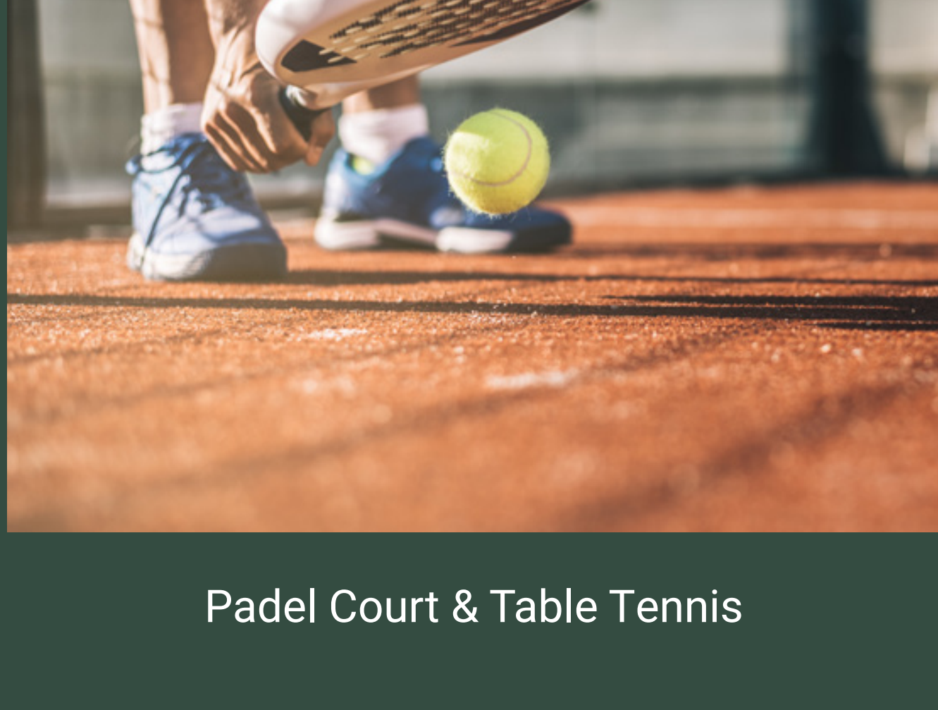
Padel Court & Table Tennis