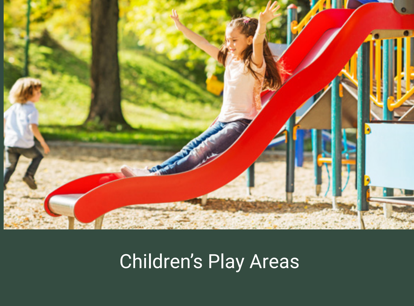
Children's Play Areas