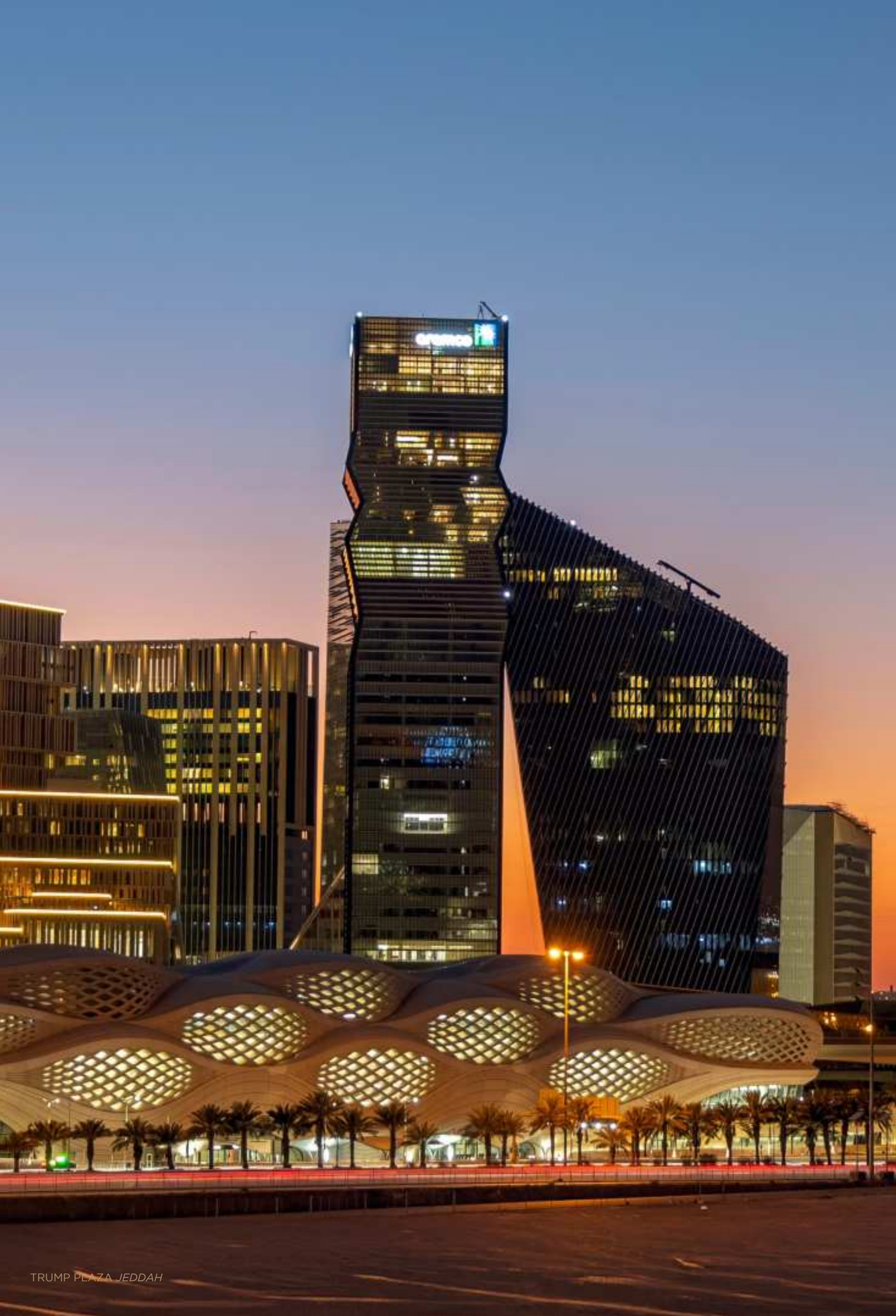
TRUMP PLAZA JEDDAH

— FULL FREEHOLD OWNERSHIP NOW AVAILABLE TO FOREIGN INVESTORS