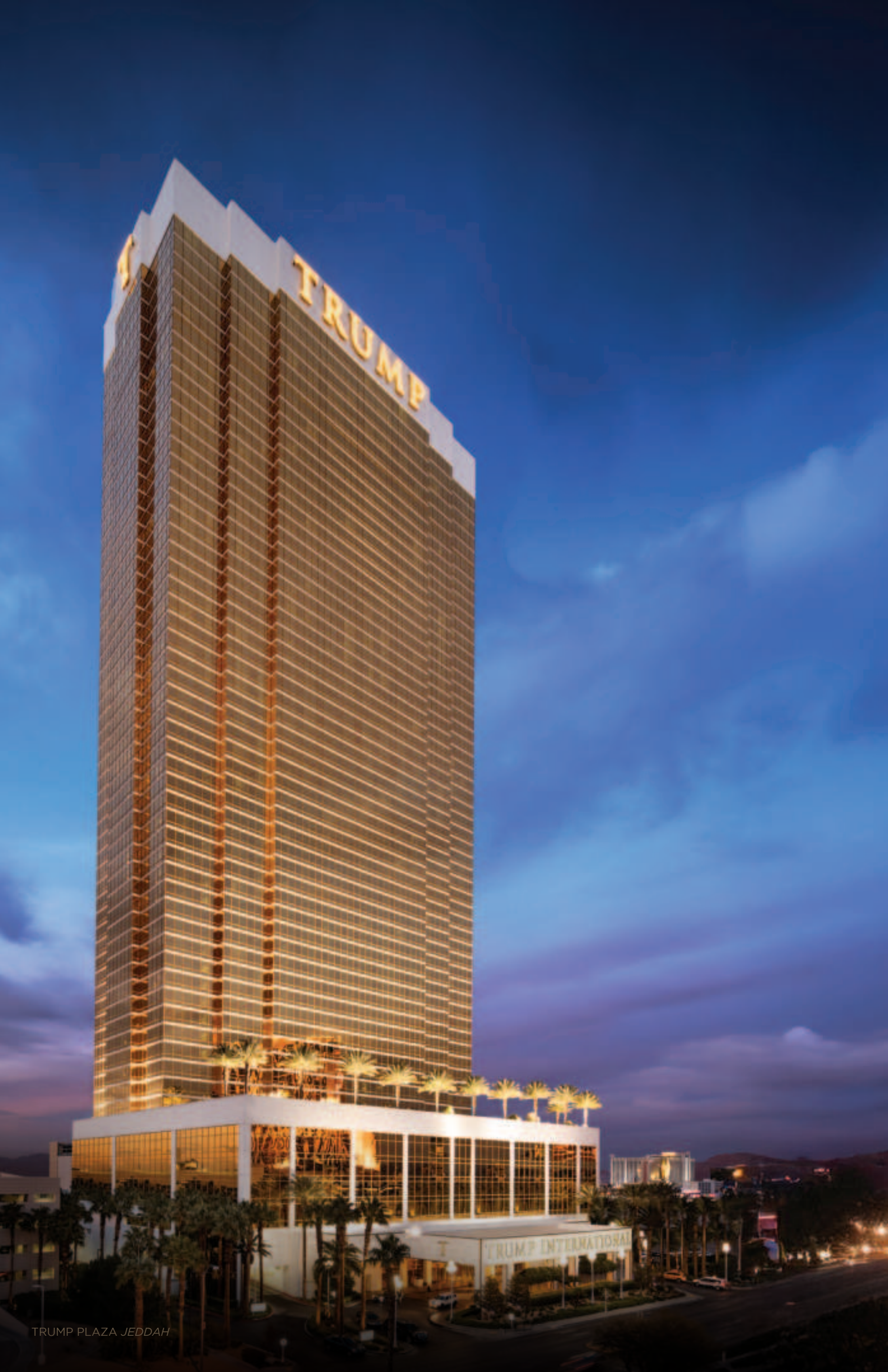
TRUMP PLAZA JEDDAH