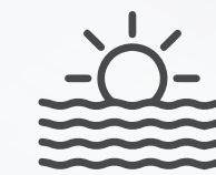
Sea Side View