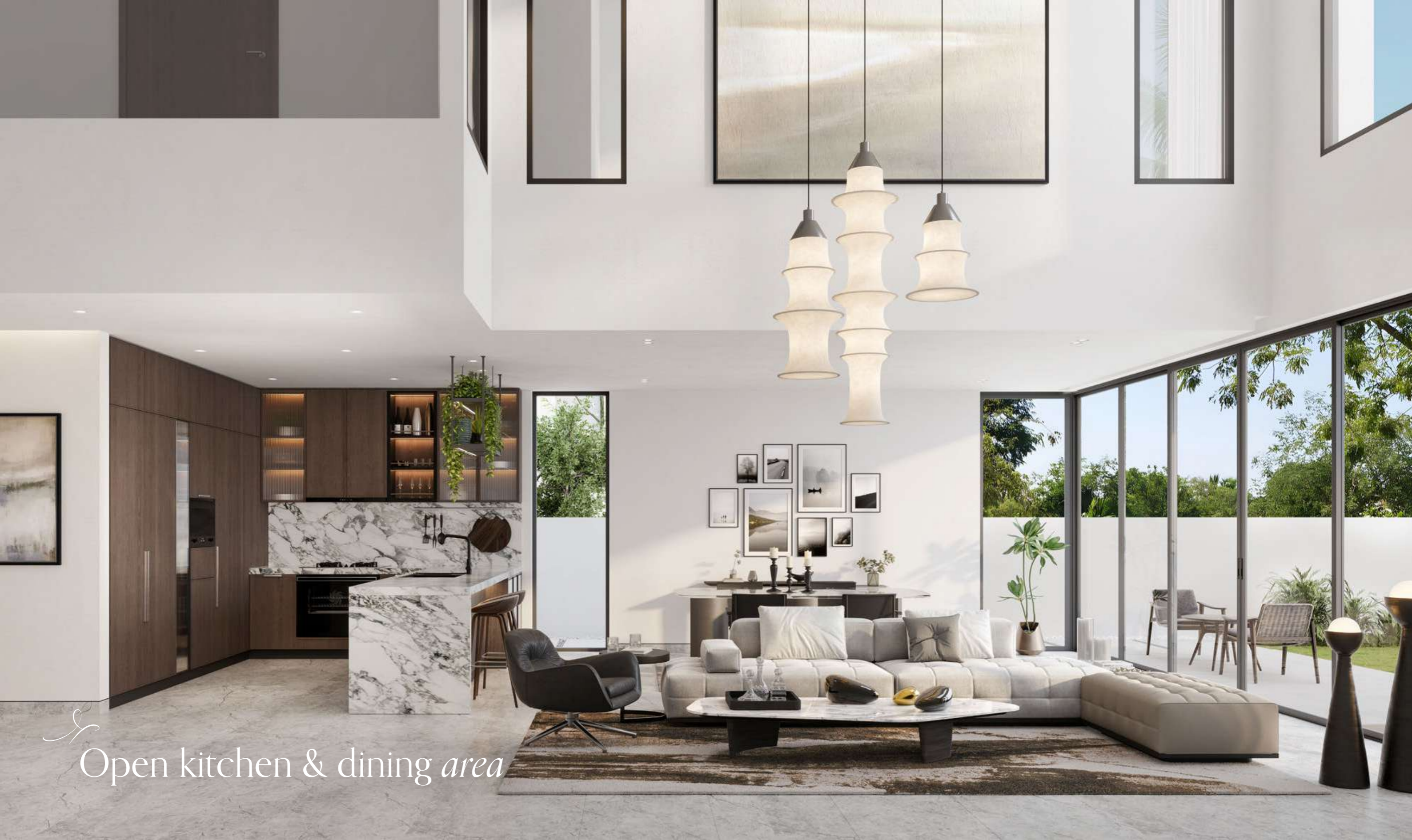
Open kitchen & dining area