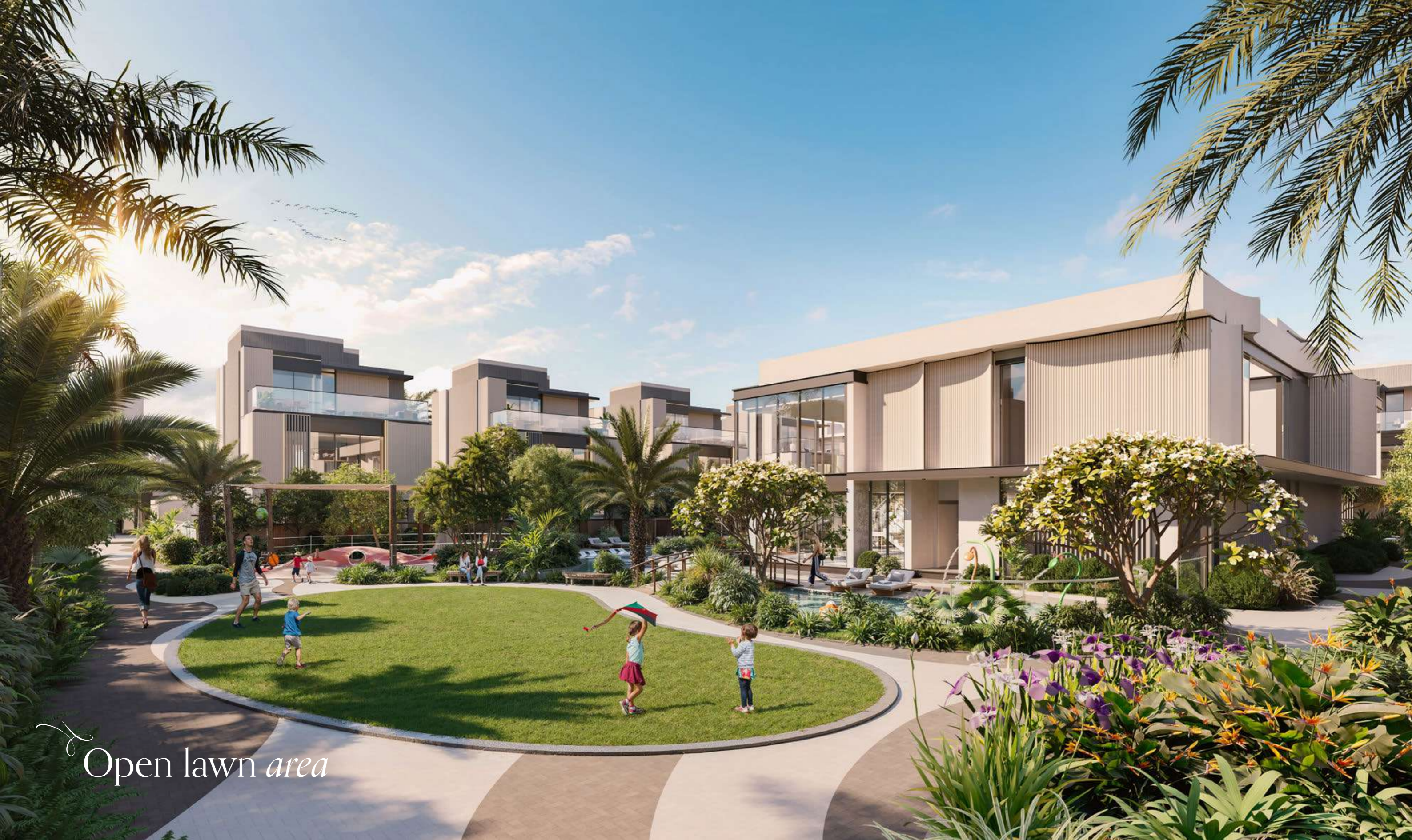
Open lawn area