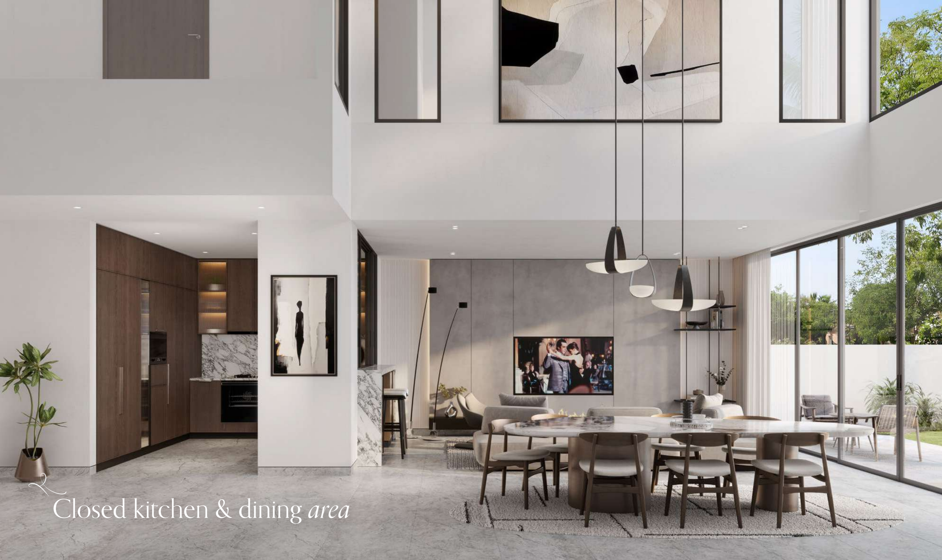
Closed kitchen & dining area