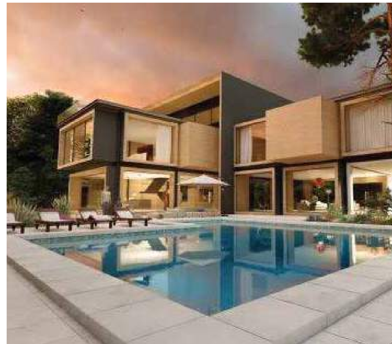
THE PLAIDES VILLAS CYPRUS