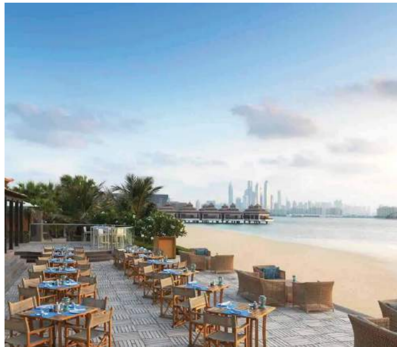
THE BEACH HOUSE PALM JUMEIRAH ,DUBAI