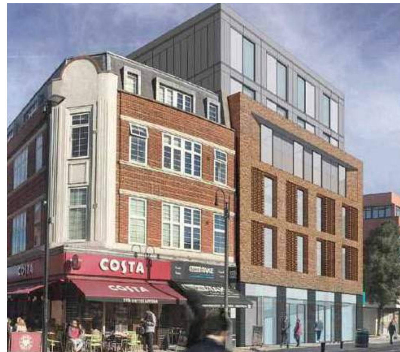
GRANDBELL PROPERTIES HOUSLOW, UK