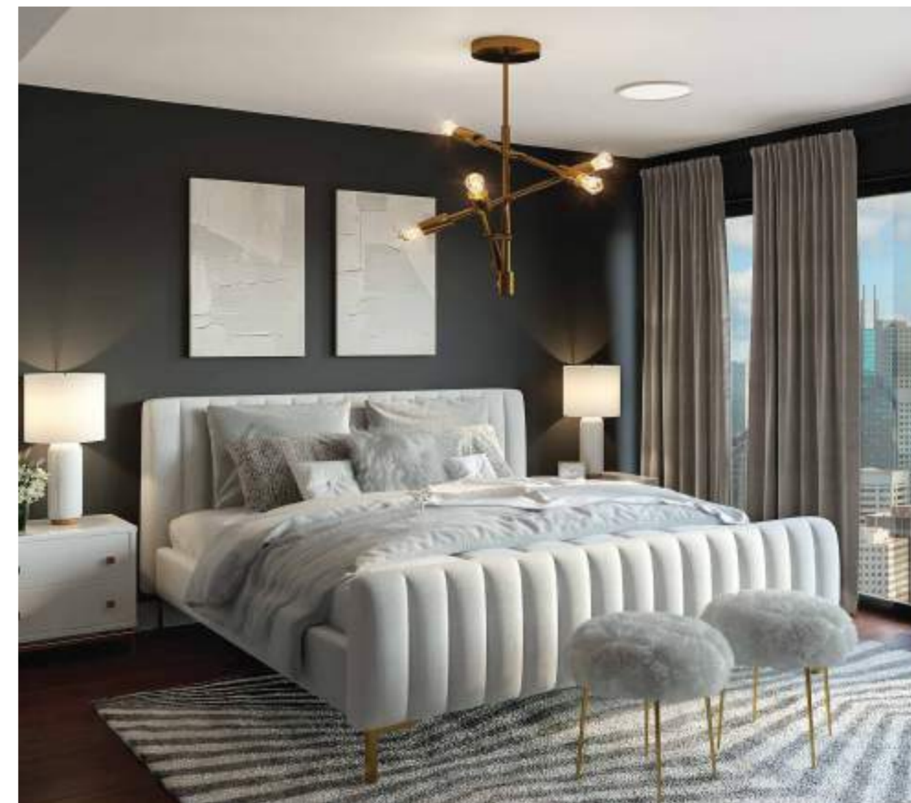
SHEPHERD BUSH LONDON UK