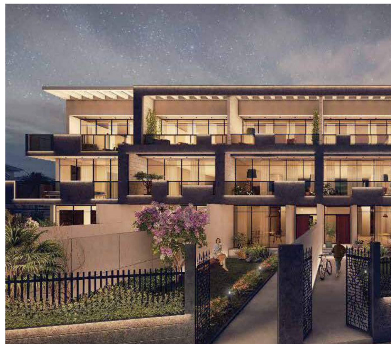
CASA LUXO JUMEIRAH VILLAGE CIRCLE, DUBAI