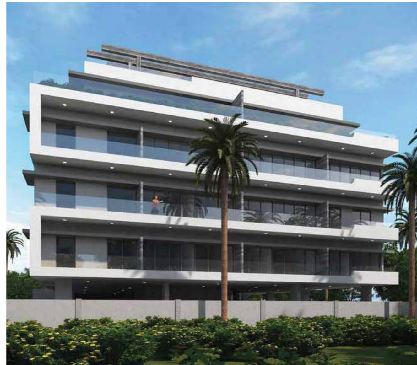
CENTURION ONYX MEYDAN AVENUE