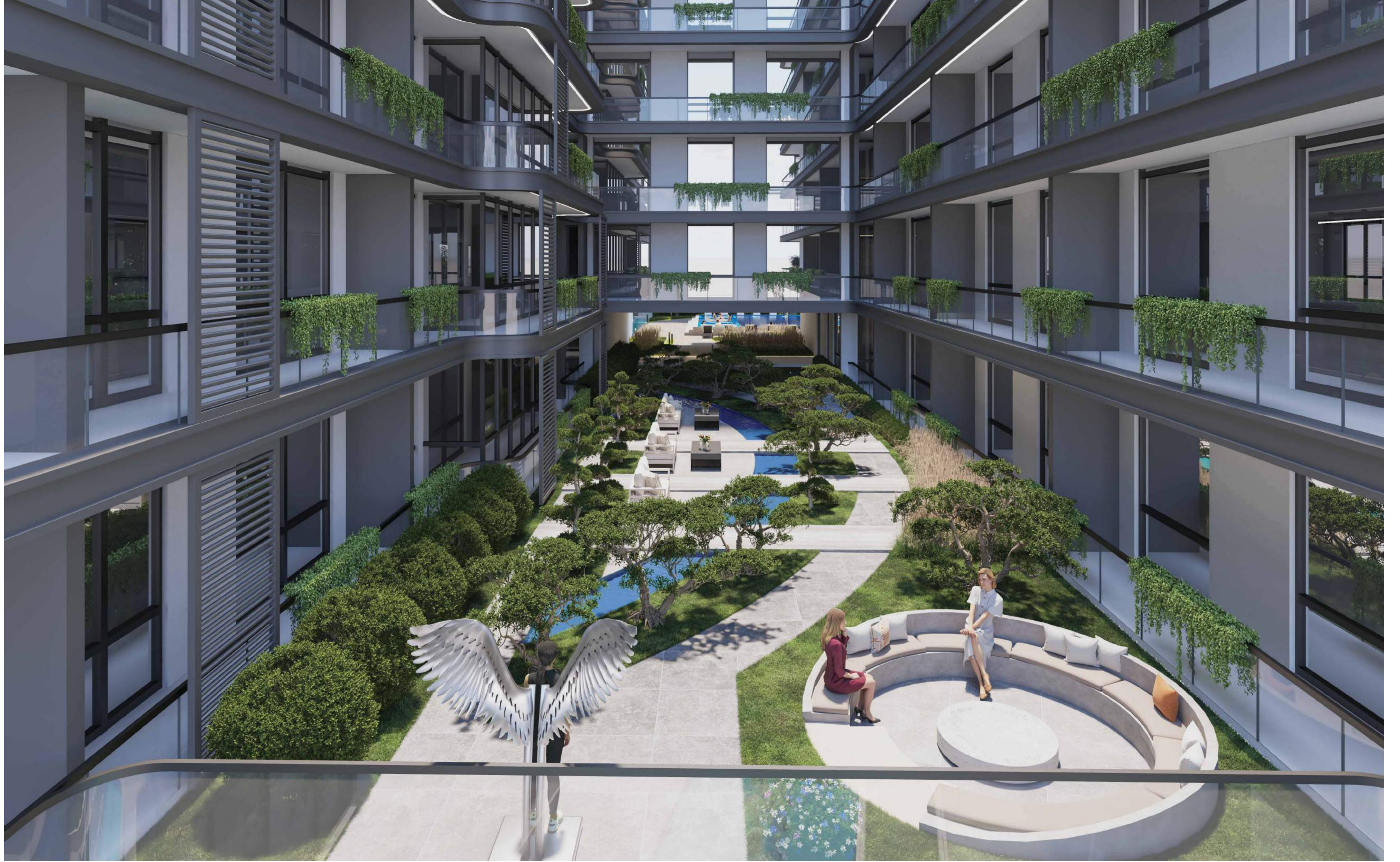
ZEN GARDEN AND INSTAGRAM SPOT