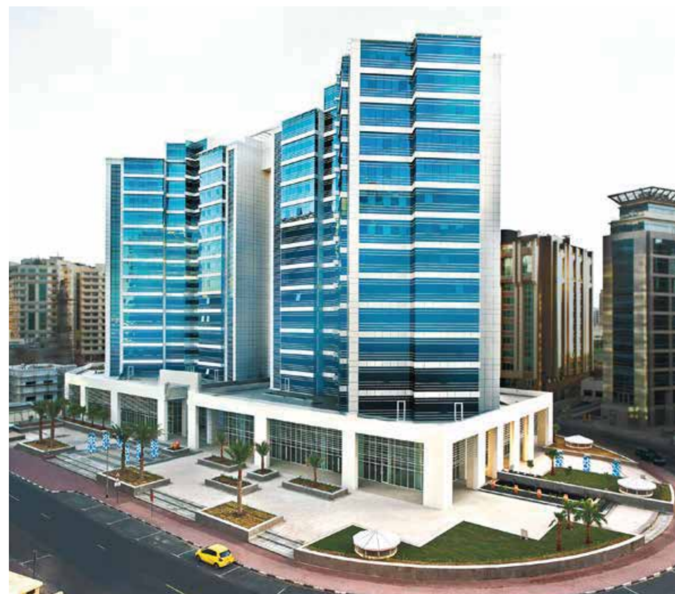
CENTURION STAR PORT SAEED, DEIRA