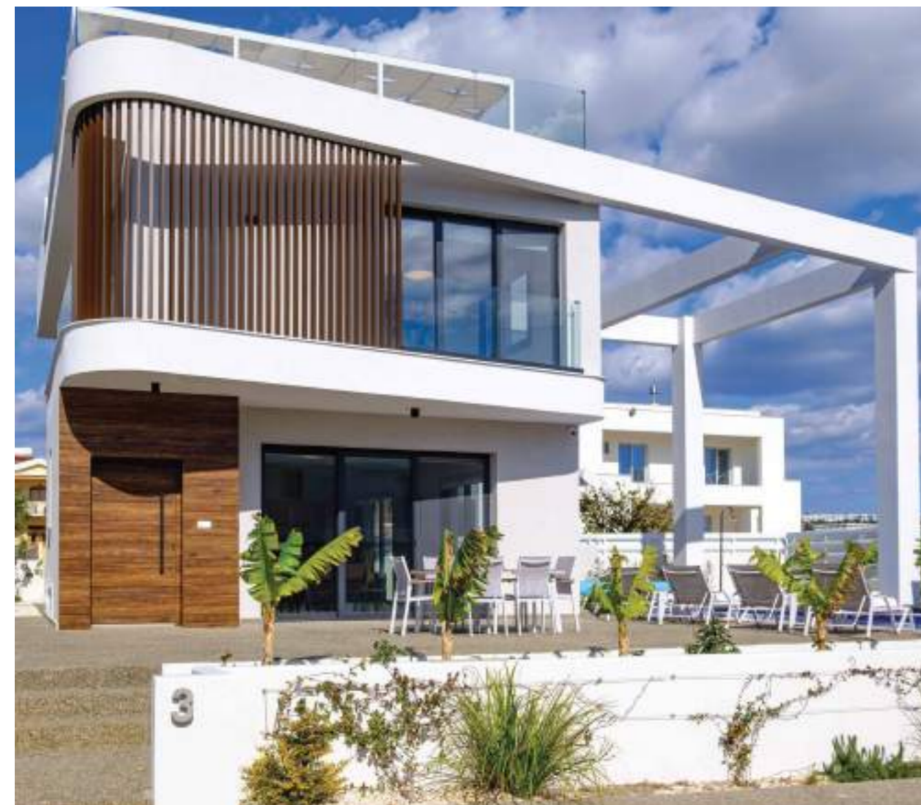
NISSI RESIDENCE CYPRUS