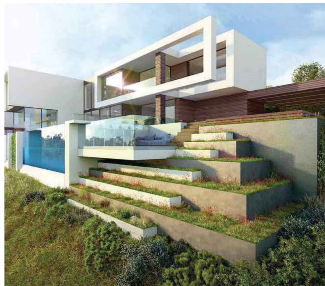
ALMYRA RESORT CYPRUS