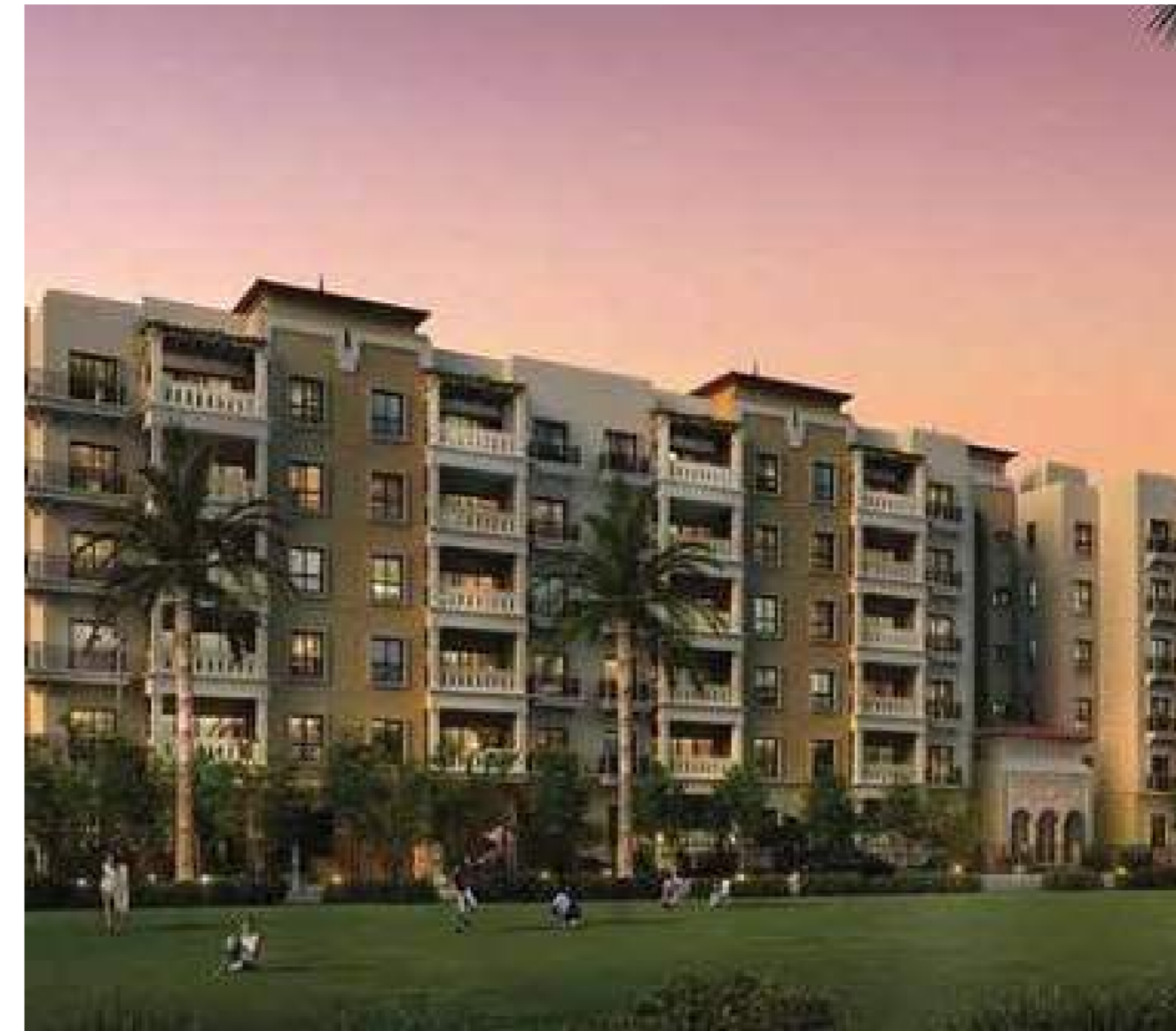
CENTURION RESIDENCE DUBAI INVESTMENT PARK -2