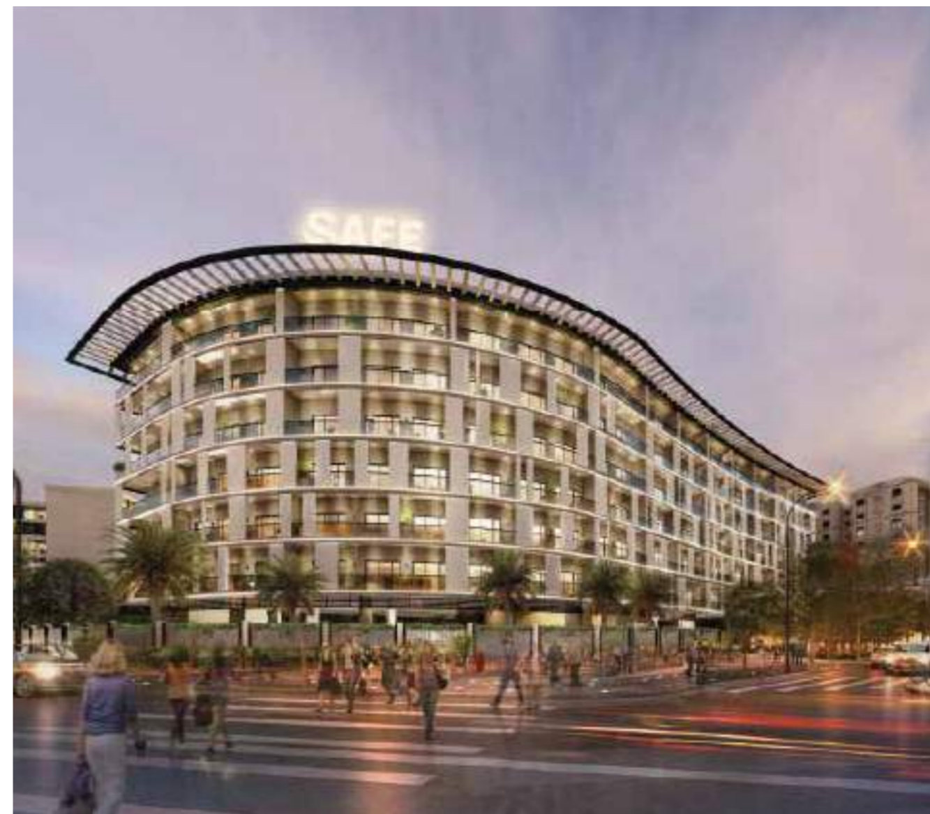
GARDENIA LIVINGS ARJAN, DUBAI