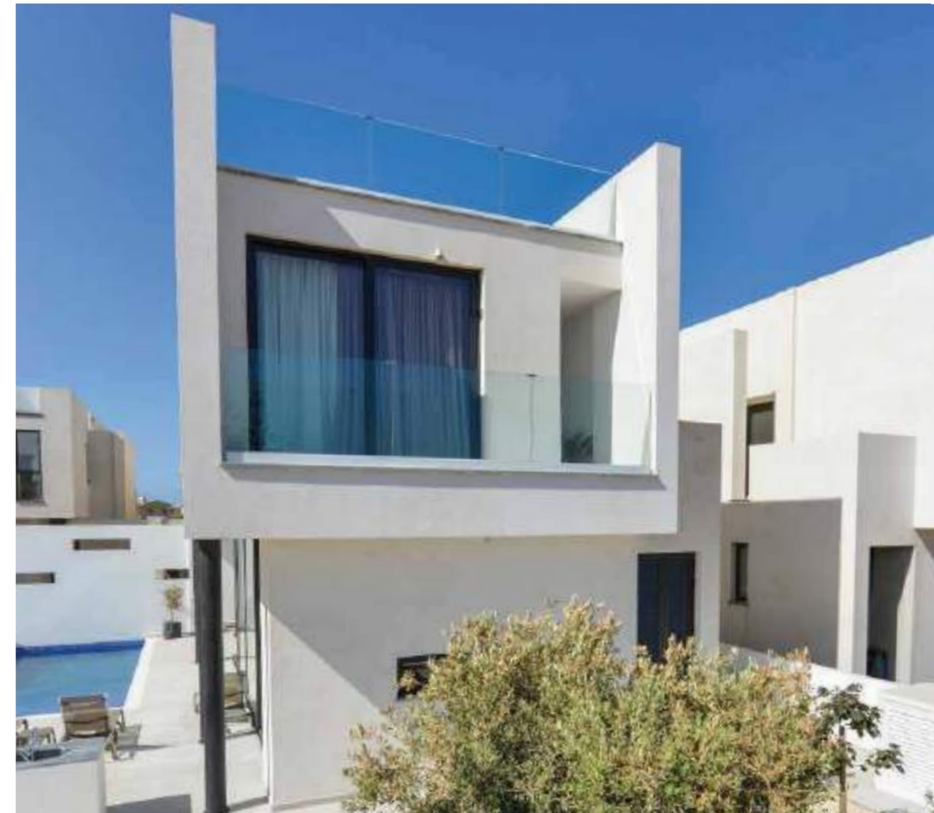
AL MARIA CYPRUS