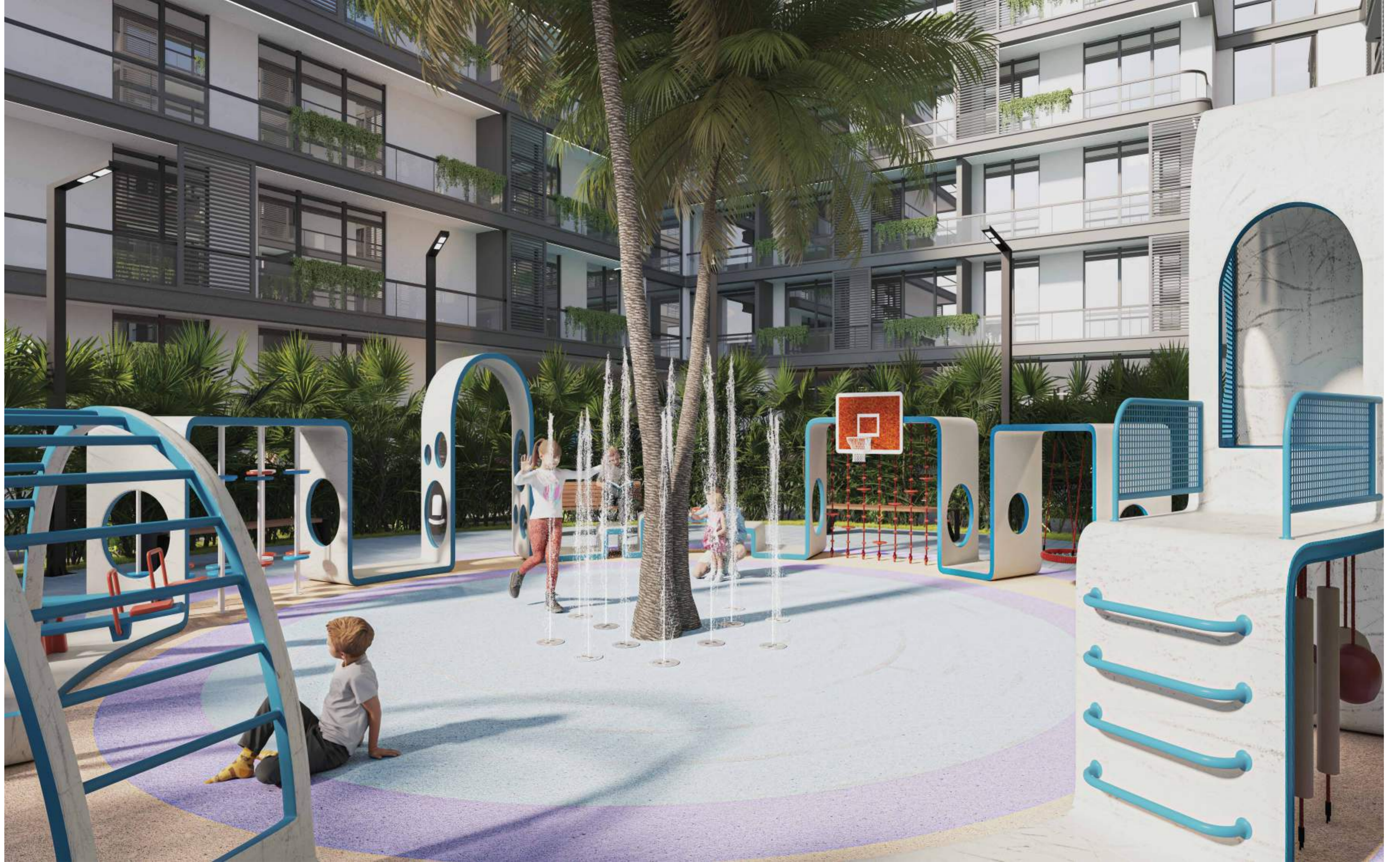
KIDS PLAY AREA WITH WATER FEATURES