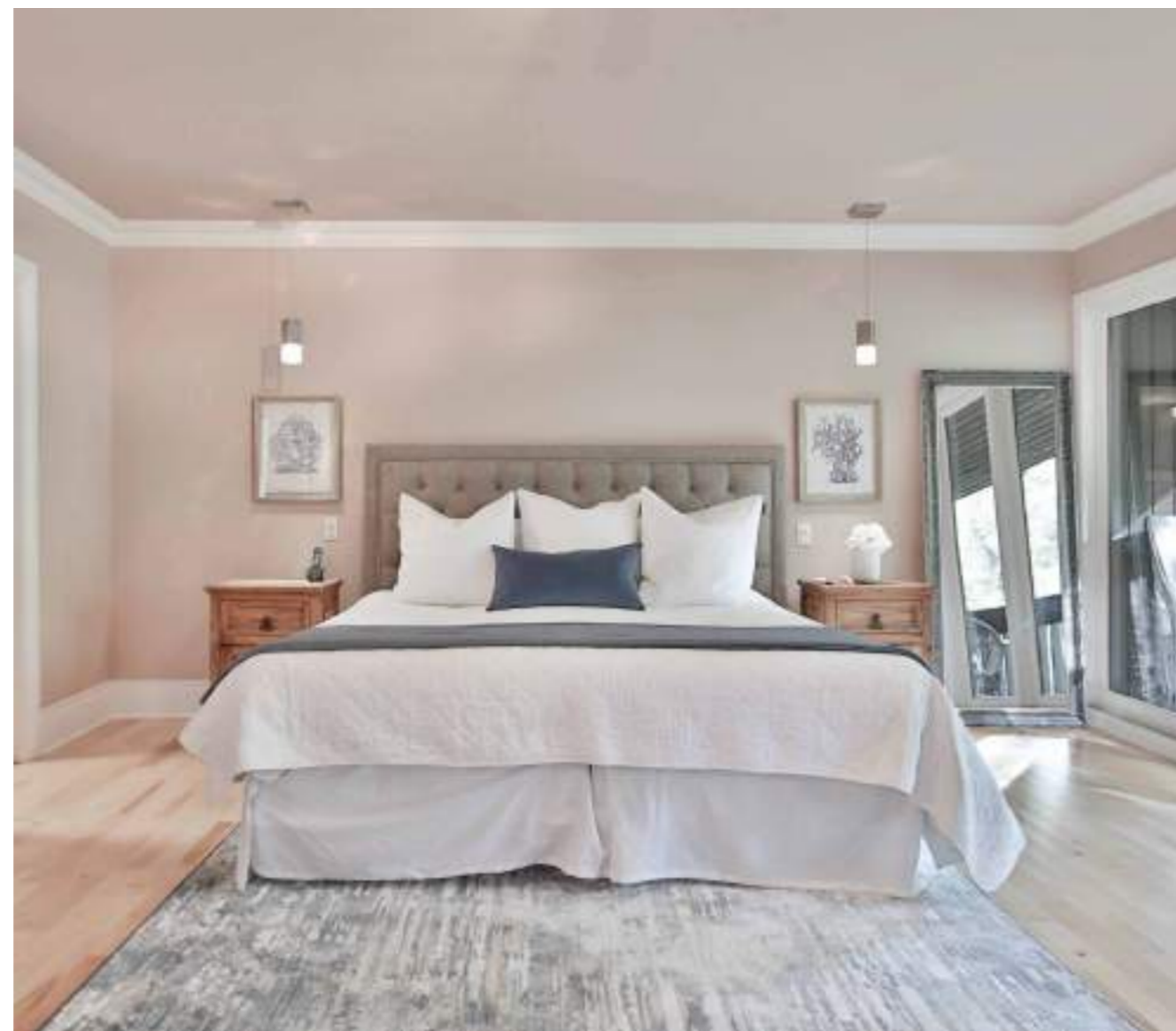
RADFORD GATE LONDON UK