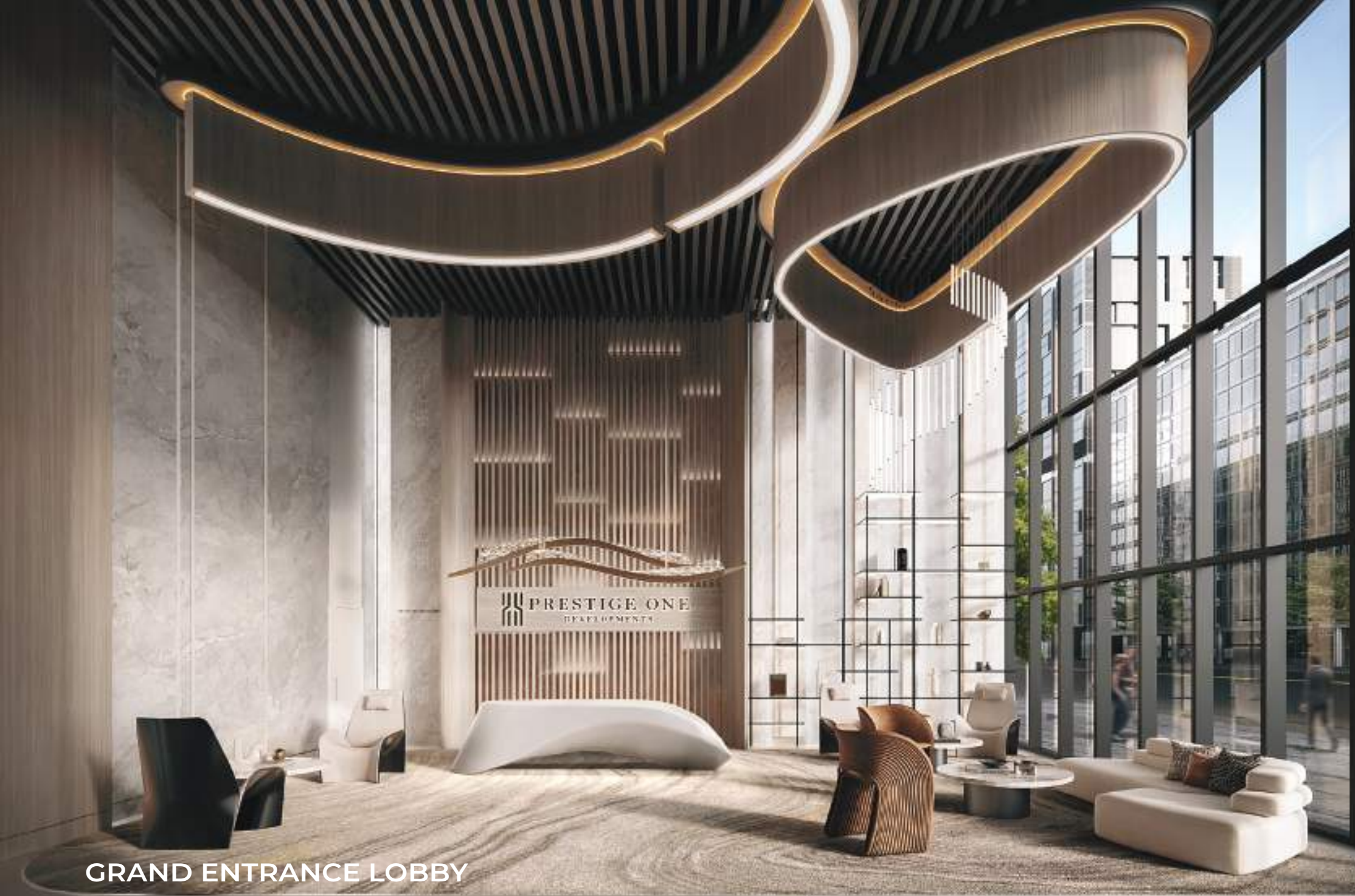
GRAND ENTRANCE LOBBY