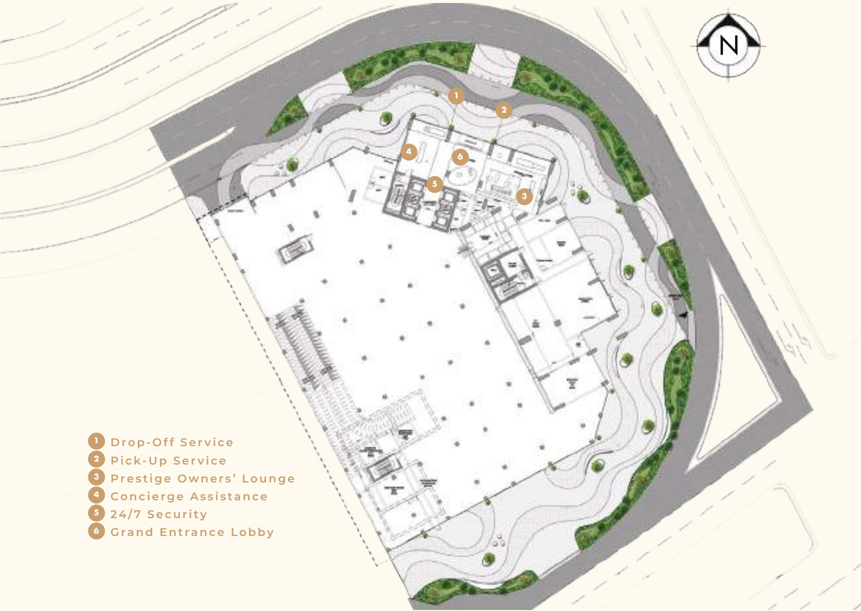
GROUND FLOOR AMENITIES PLAN

The ground floor embodies effortless luxury with spaces focused on comfort, ease of access, and personalized services, ensuring a smooth and welcoming experience from the moment you arrive.