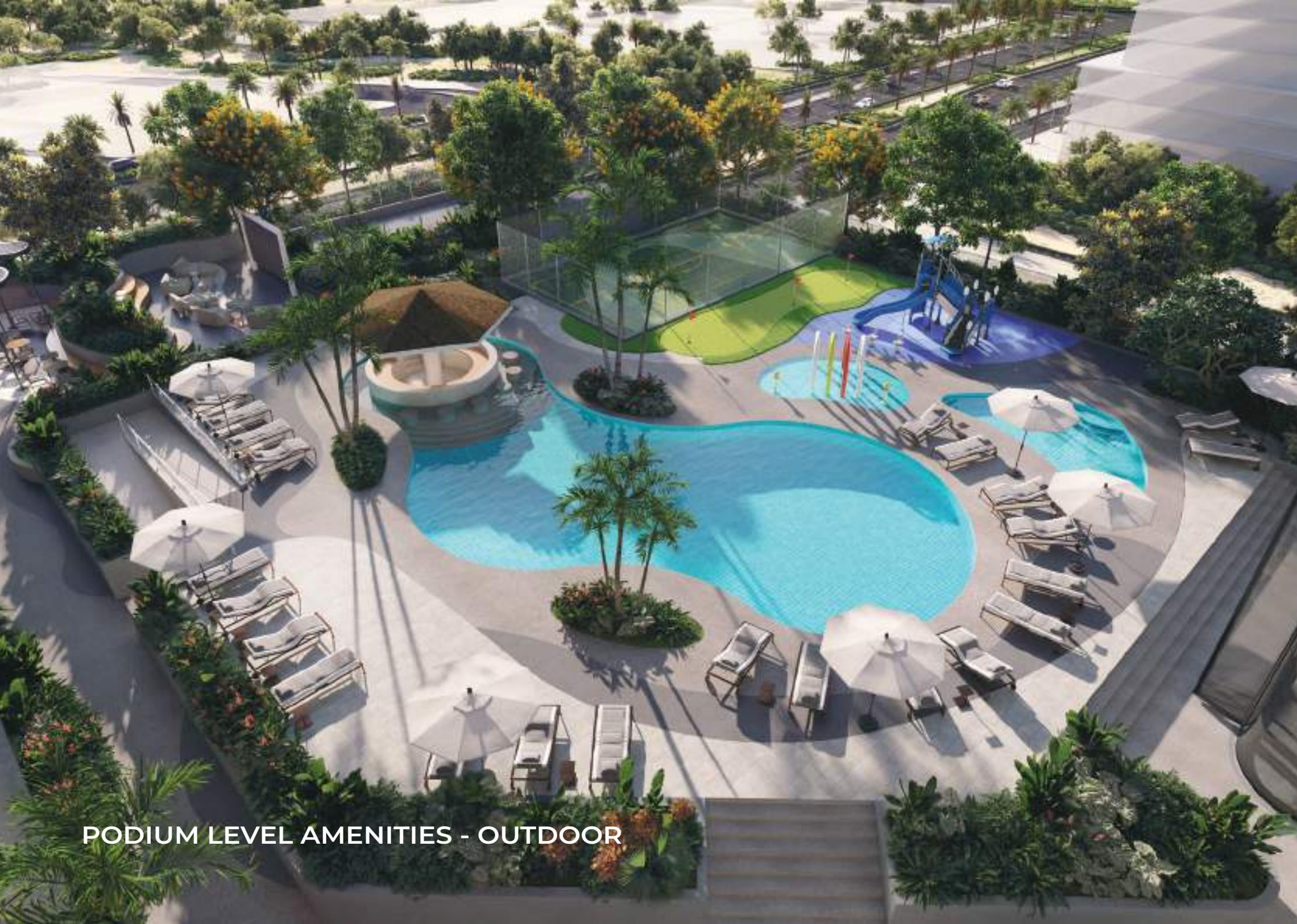
PODIUM LEVEL AMENITIES - OUTDOOR