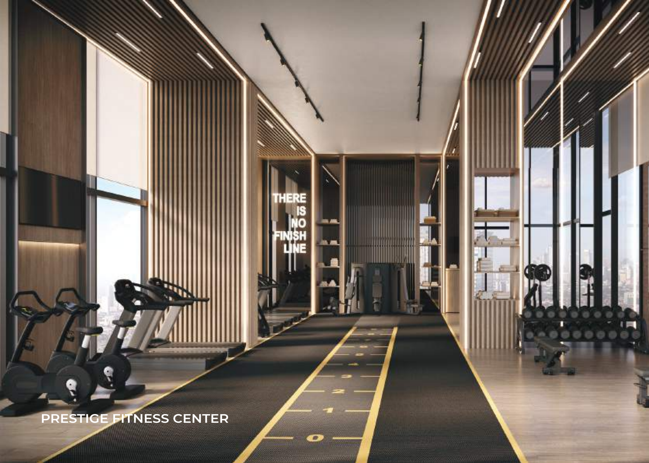
PRESTIGE FITNESS CENTER