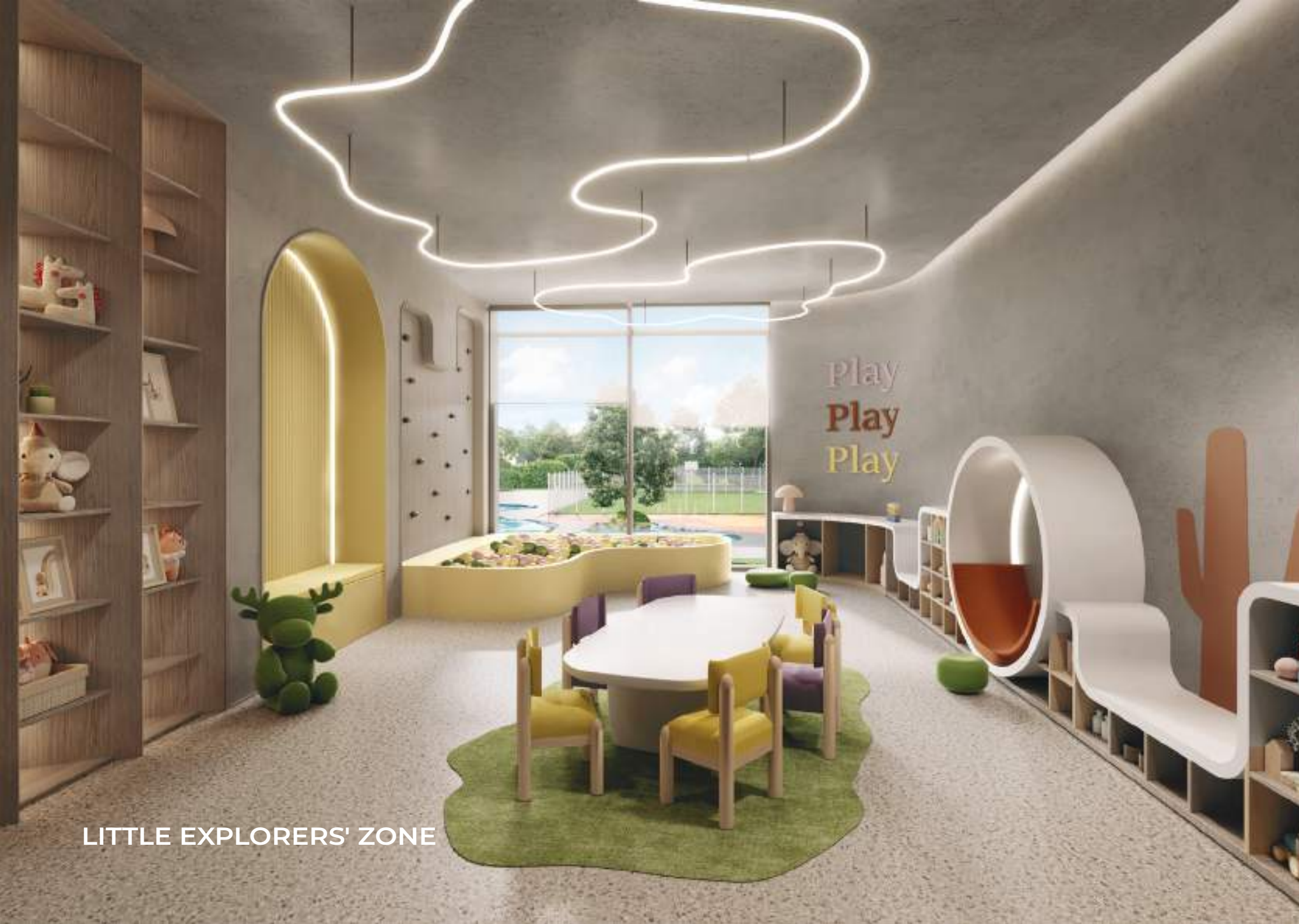
LITTLE EXPLORERS' ZONE