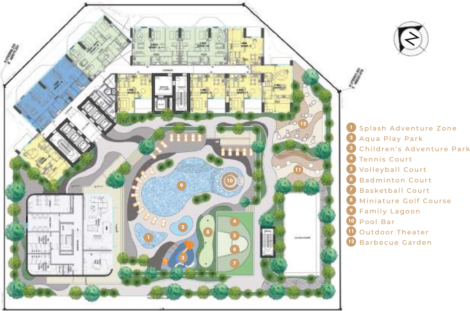
PODIUM LEVEL AMENITIES PLAN - OUTDOOR

On the outdoor side, the podium features open spaces that harmoniously blend with the natural surroundings, creating an inviting environment for residents to enjoy the outdoors and engage with nature.