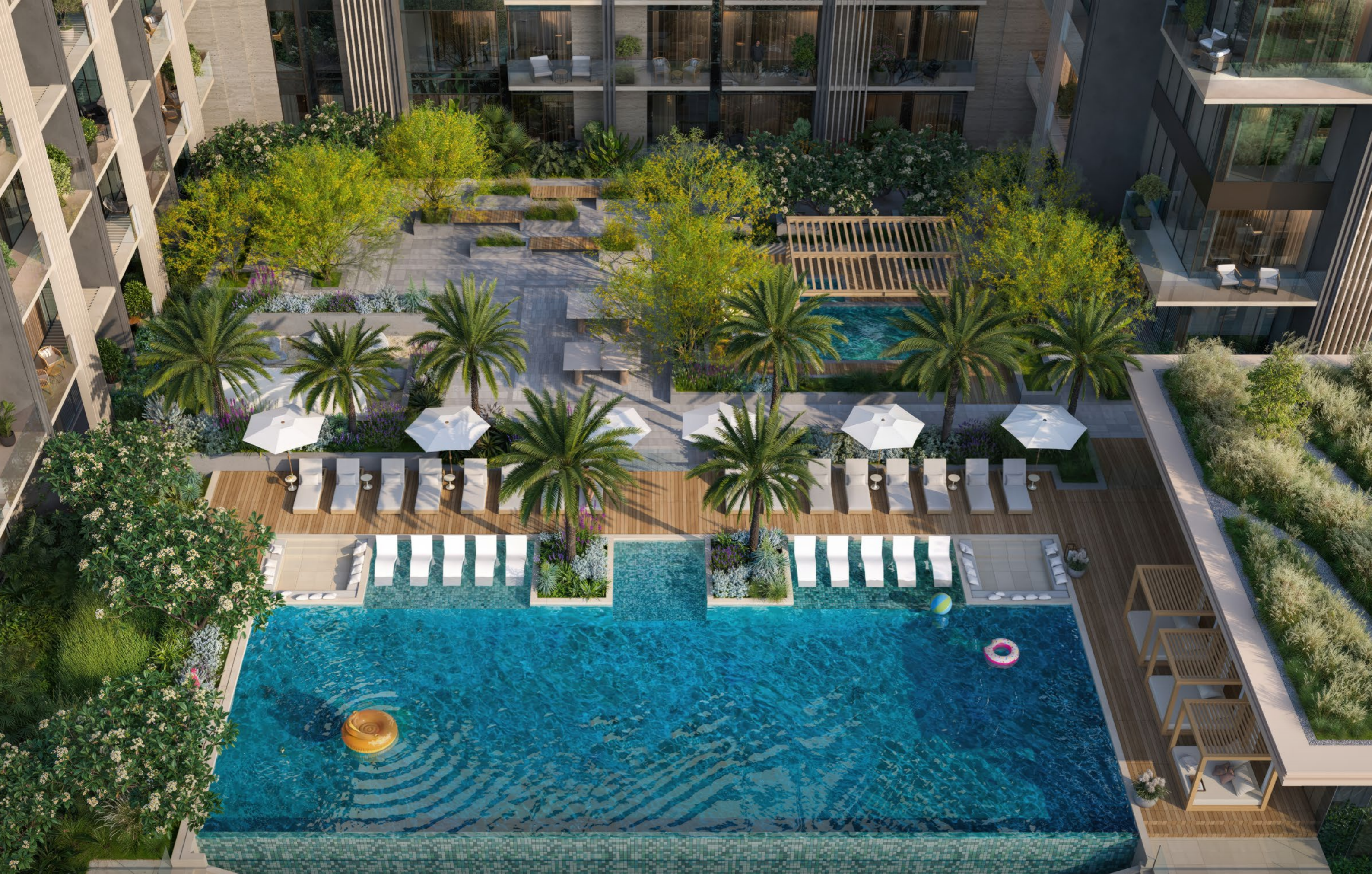
Harmonising Nature and Water