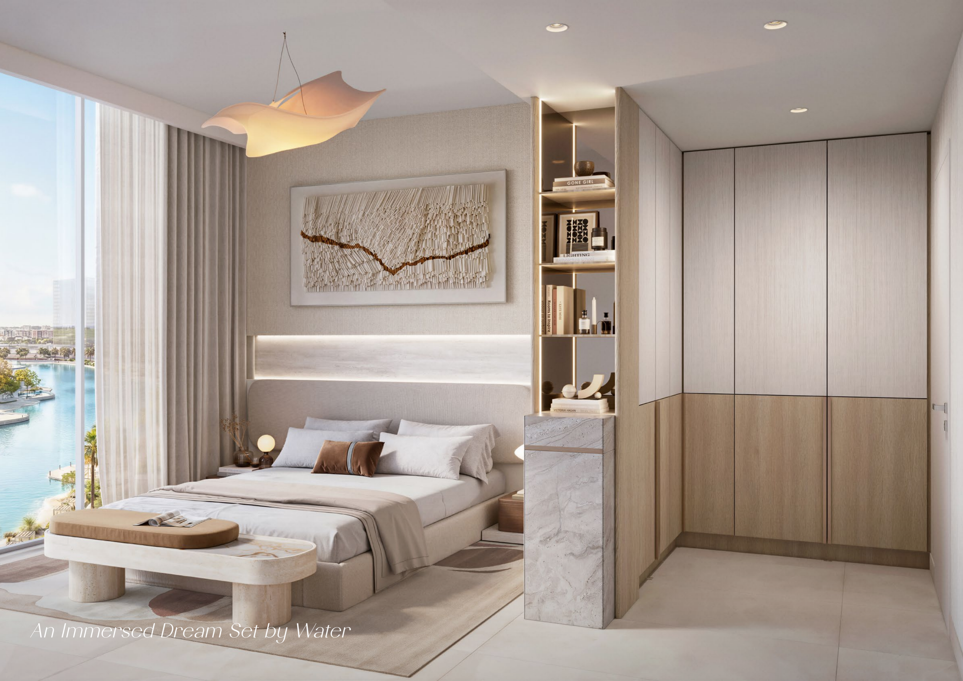
An Immersed Dream Set by Water